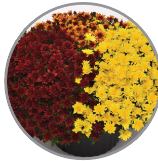
MILKSHAKE Banana Yellow • Papaya Orange Strawberry Red