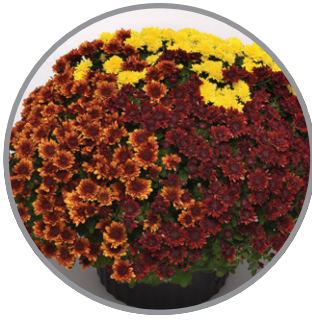
Orange • Red • Sunny Yellow