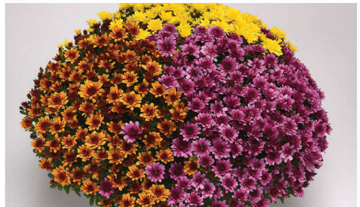
Mix Banana Yellow • Berry Pink • Papaya Orange