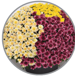
Crème White • Pink • Sunny Yellow