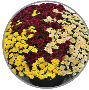
Crème White • Purple • Sunny Yellow