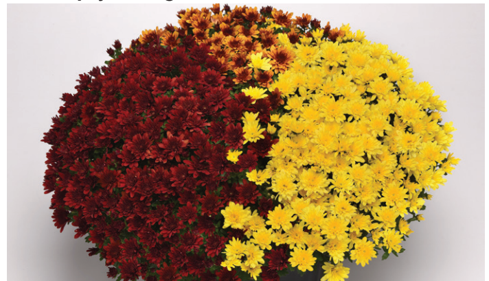
Mix Banana Yellow • Papaya Orange • Strawberry Red