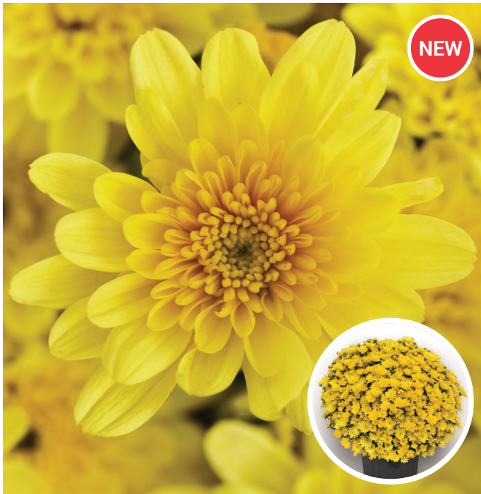
NEW Banana Yellow