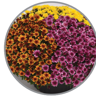
Banana Yellow • Berry Pink Papaya Orange