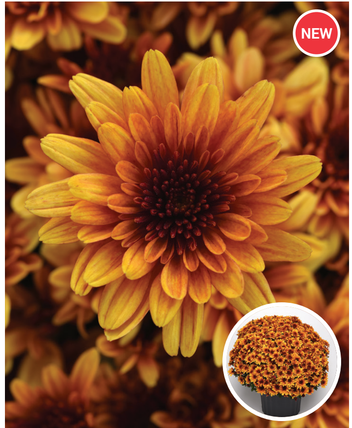
NEW Papaya Orange