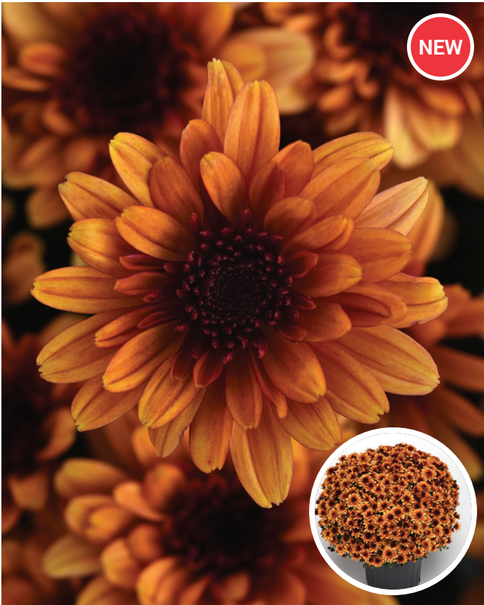
NEW Kiwi Bronze