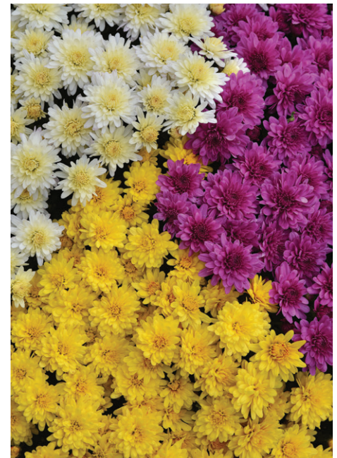
Mix Dark Pink • Yellow • White