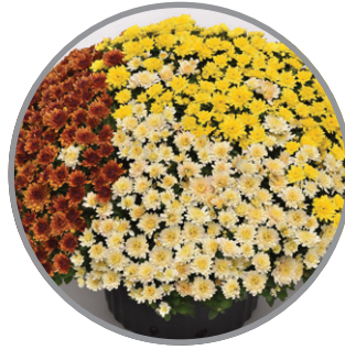
Crème White • Orange • Sunny Yellow