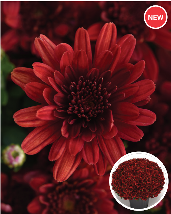
NEW Strawberry Red