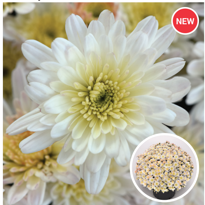
NEW Coconut White