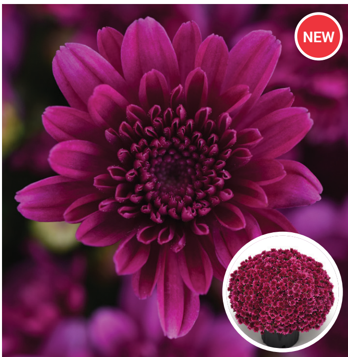
NEW Cherry Purple