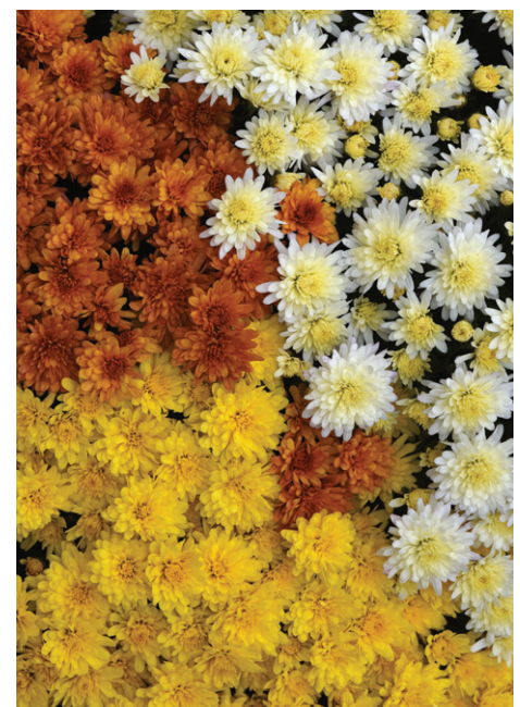
Mix Amber Orange • Yellow • White