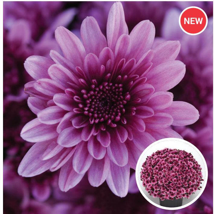
NEW Berry Pink