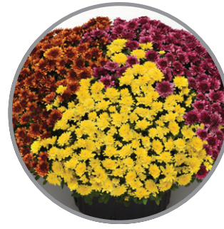
Orange • Pink • Sunny Yellow