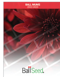
On the Cover: Tribeca Yellow