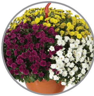
SKYFALL Lemon Yellow • Purple • White