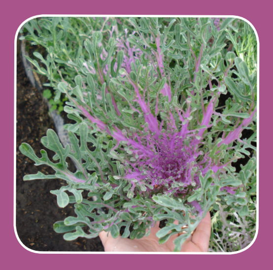
Pink-purple center surrounded by serrated leaves.