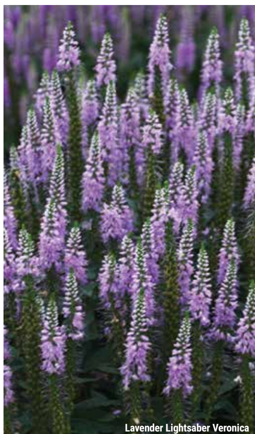
Lavender Lightsaber Veronica