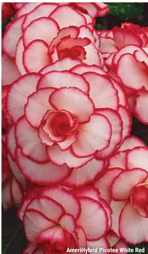
AmeriHybrid Picotee White Red