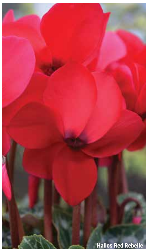
Halios Red Rebelle