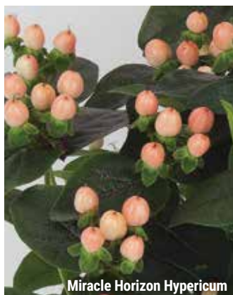
Miracle Horizon Hypericum