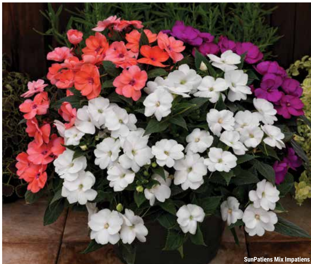
SunPatiens Mix Impatiens

Large flowers are full of color and easy to grow in full sun in home gardens or containers.