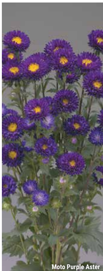
Moto Purple Aster