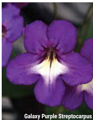
Galaxy Purple Streptocarpus