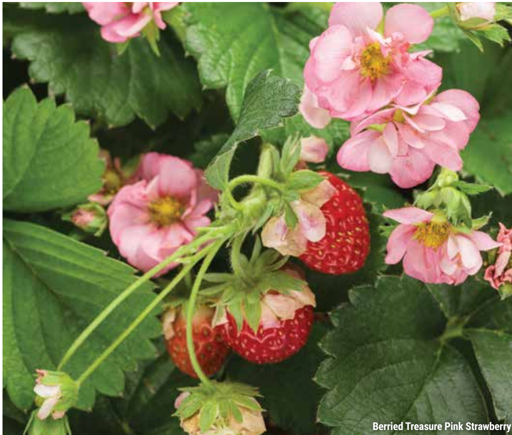
Berried Treasure Pink Strawberry