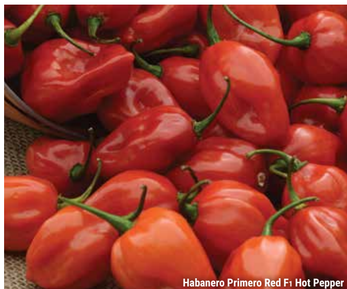
Habanero Primero Red F1 Hot Pepper

These big, delicious peppers are great for salsa or stuffing.