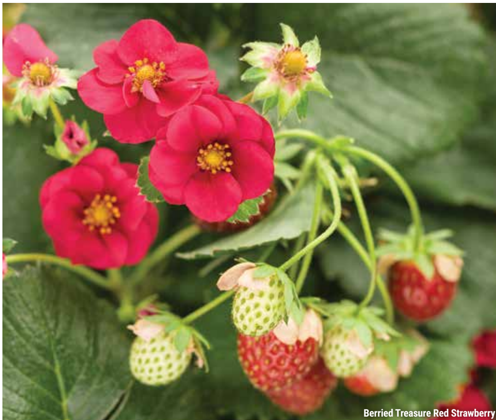
Berried Treasure Red Strawberry