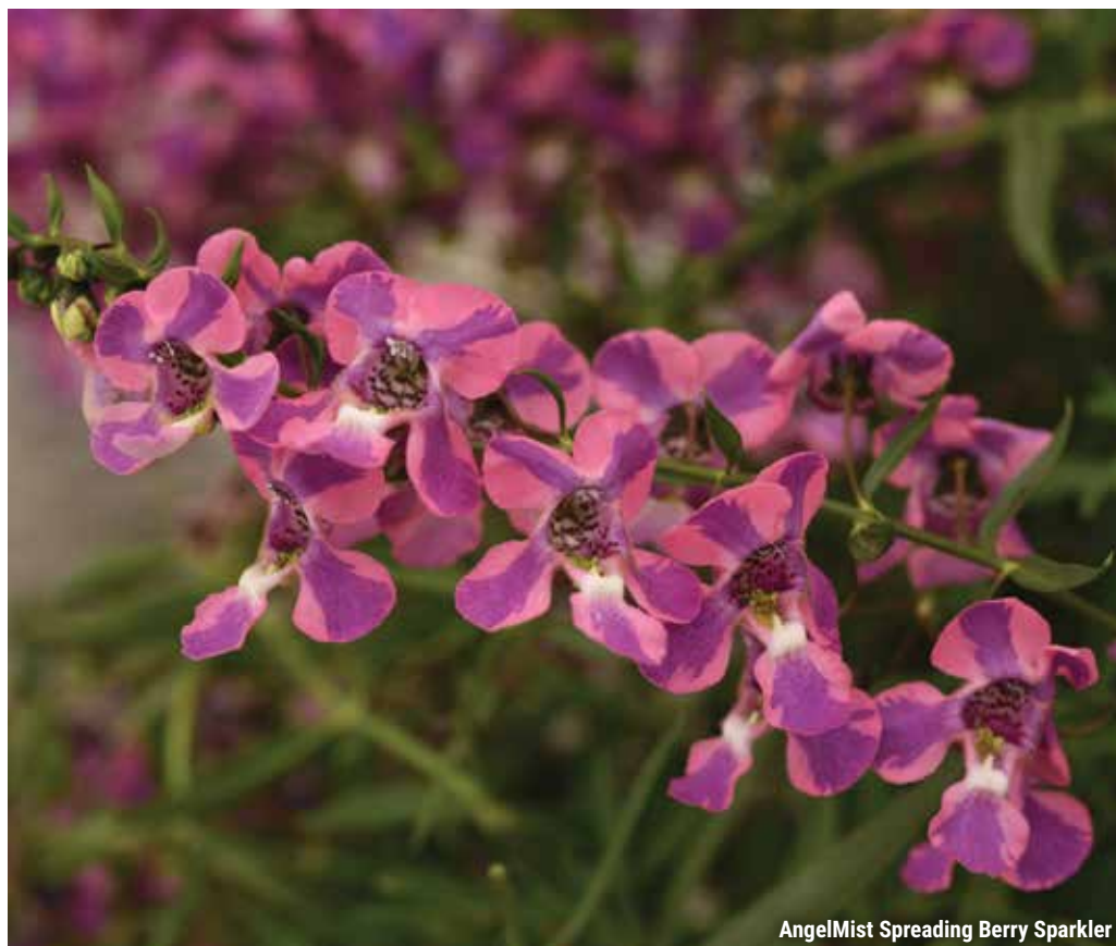
AngelMist Spreading Berry Sparkler