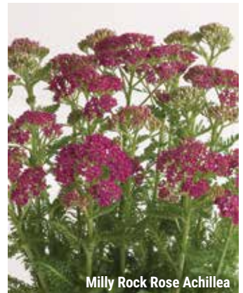
Milly Rock Rose Achillea