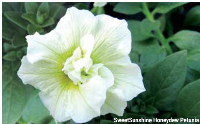
SweetSunshine Honeydew Petunia