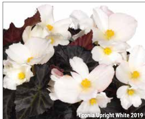
l'conia Upright White 2019