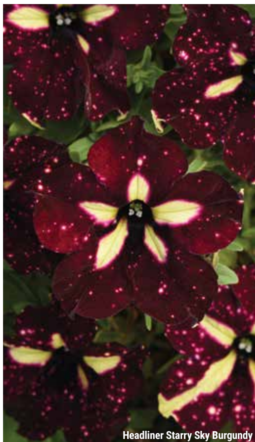
Headliner Starry Sky Burgundy