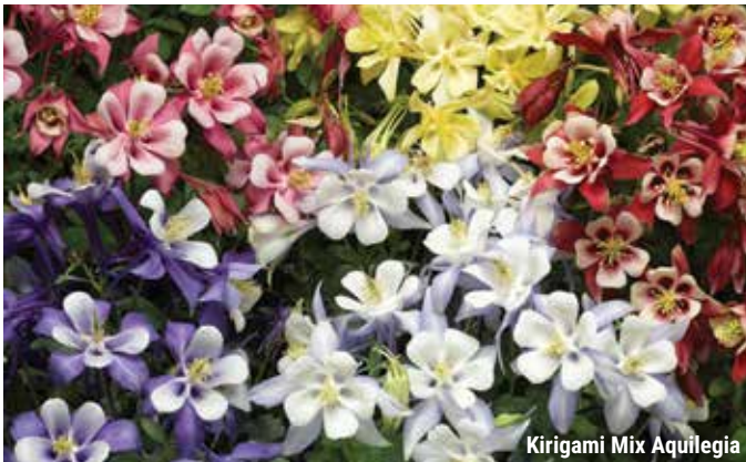
Kirigami Mix Aquilegia