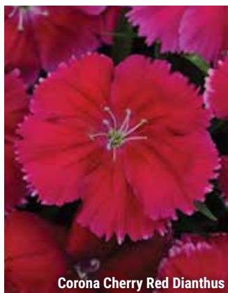
Corona Cherry Red Dianthus