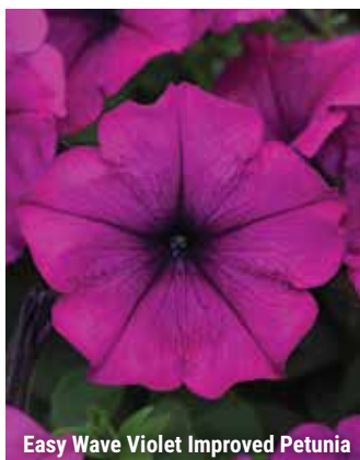
Easy Wave Violet Improved Petunia