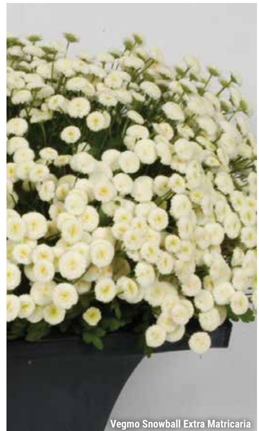
Vegmo Snowball Extra Matricaria