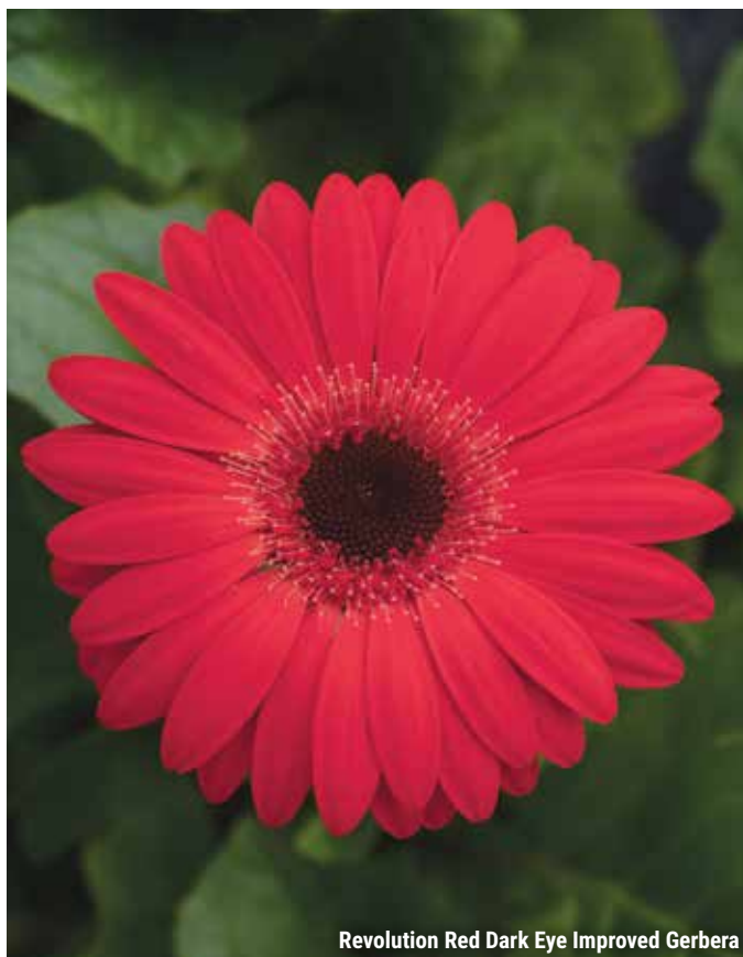
Revolution Red Dark Eye Improved Gerbera

Clear, yellow-filled flowers are a real standout; compact, smaller-leaved plants are more manageable and programmable on the bench, and more appealing in the store.