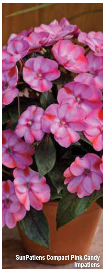
SunPatiens Compact Pink Candy Impatiens