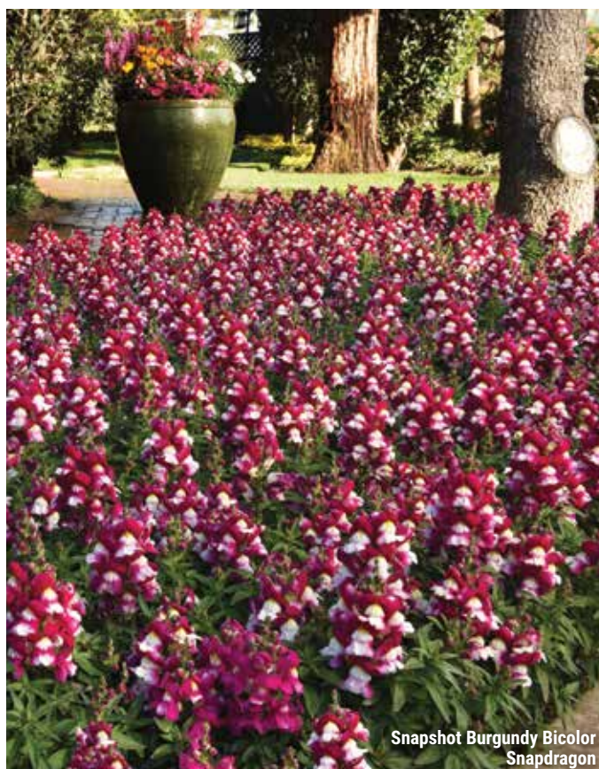
Snapshot Burgundy Bicolor Snapdragon