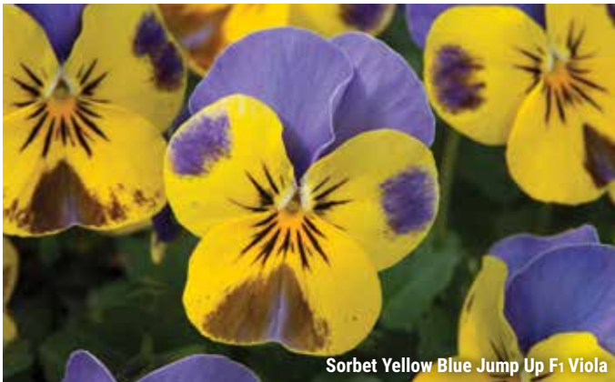
Sorbet Yellow Blue Jump Up F1 Viola