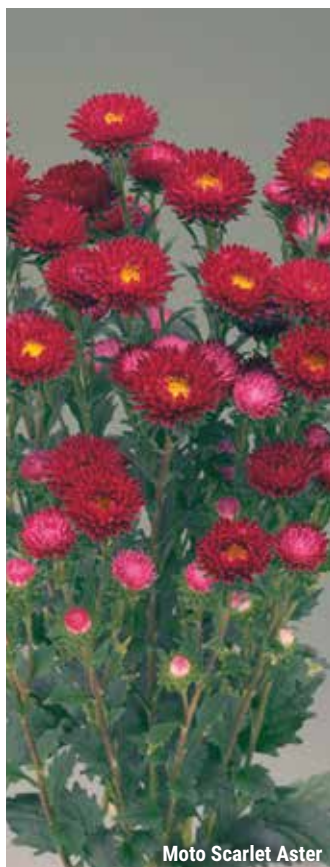
Moto Scarlet Aster