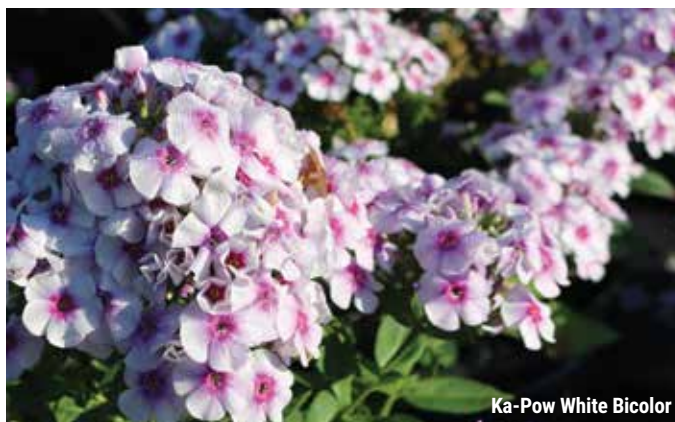
Ka-Pow White Bicolor