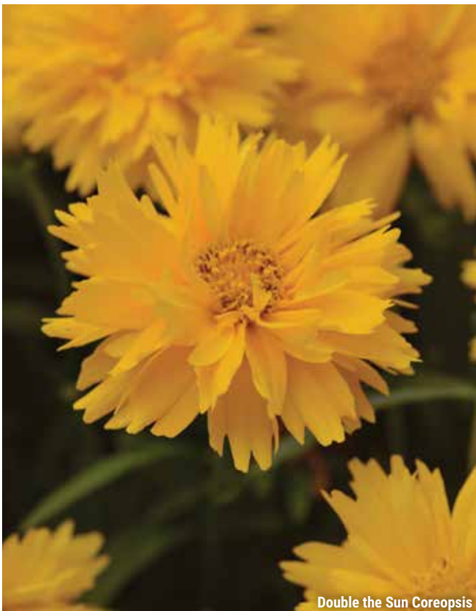
Double the Sun Coreopsis