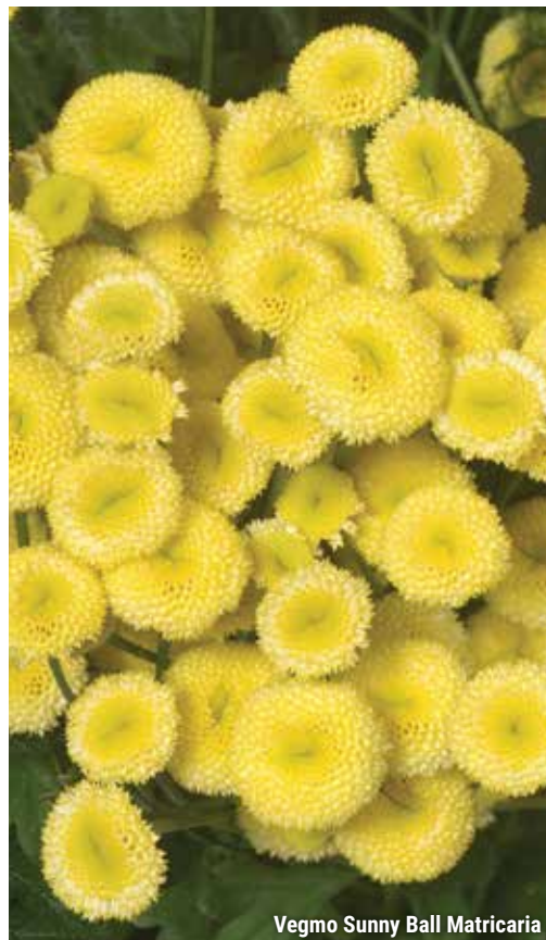
Vegmo Sunny Ball Matricaria