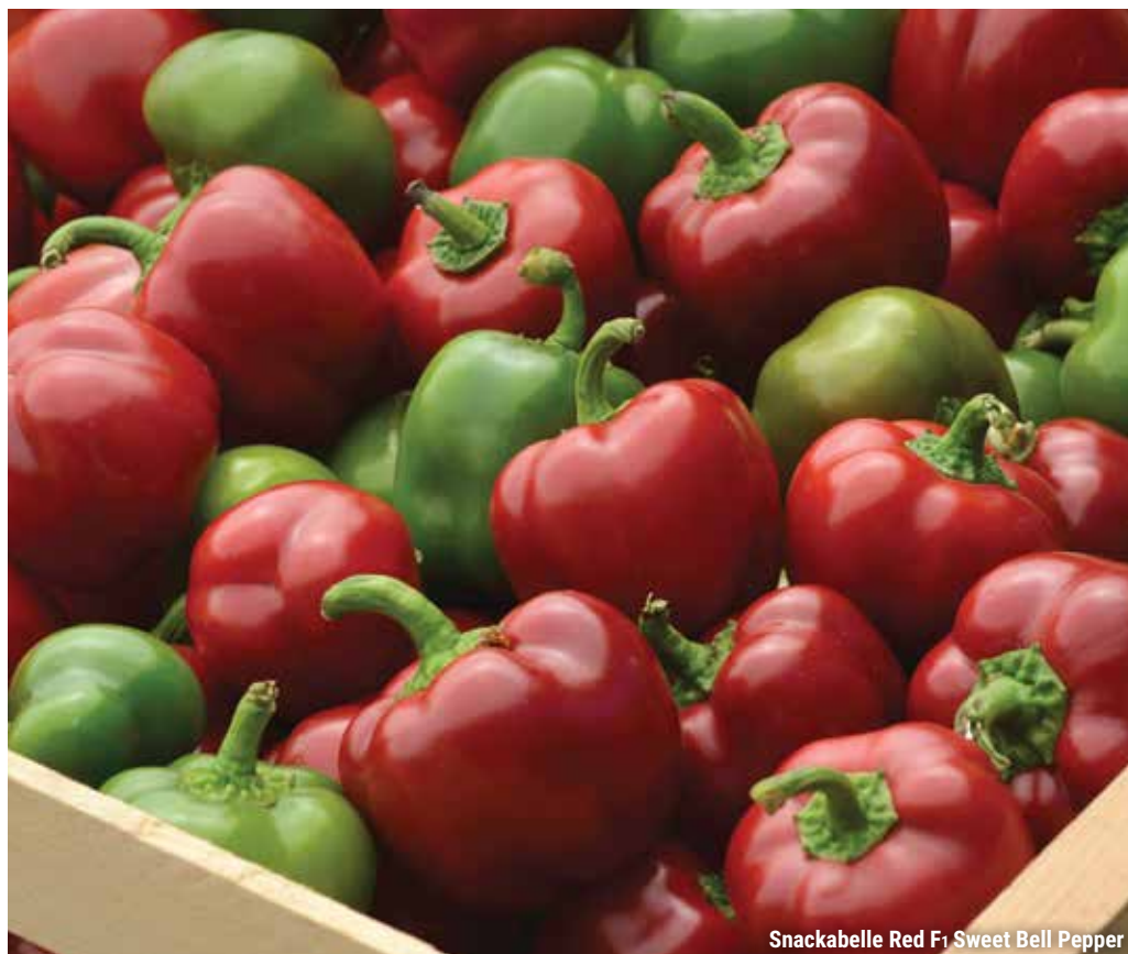
Snackabelle Red F1 Sweet Bell Pepper

Early-maturing plant with green stems, green leaves and white flowers produces heavy yields of sweet peppers.