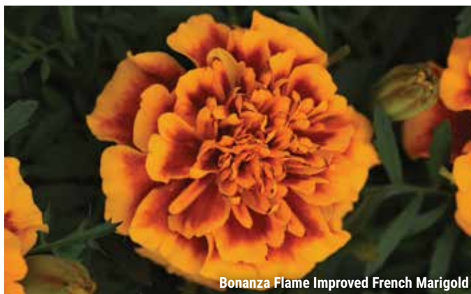
Bonanza Flame Improved French Marigold

Larger version of the Kiss series features bigger, striped, 4.5-in. (11-cm) blooms on full, bushy plants that fill in containers quickly.