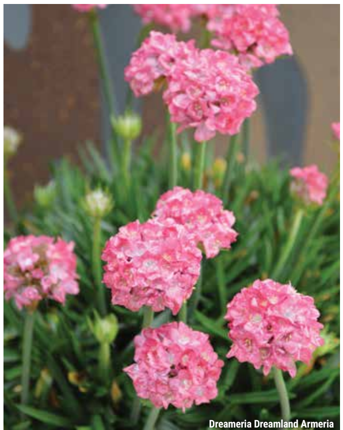
Dreameria Dreamland Armeria