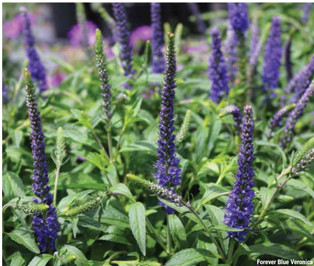
Forever Blue Veronica