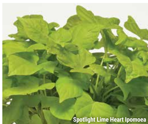
Spotlight Lime Heart Ipomoea