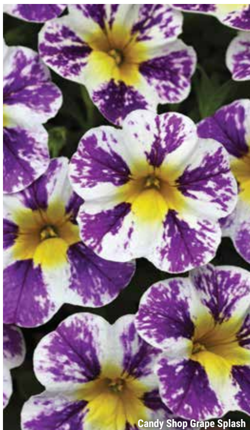
Candy Shop Grape Splash