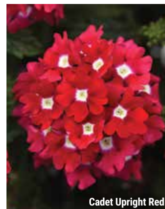
Cadet Upright Red

Both offer excellent Powdery Mildew resistance and need fewer chemical applications, plus they are fast off the bench and on to retail shelves.