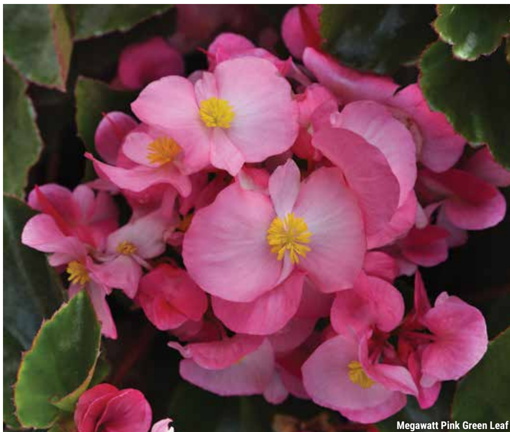
Megawatt Pink Green Leaf