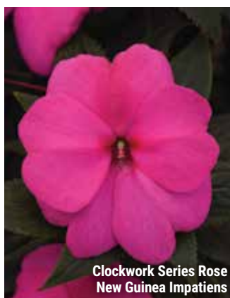
Clockwork Series Rose New Guinea Impatiens