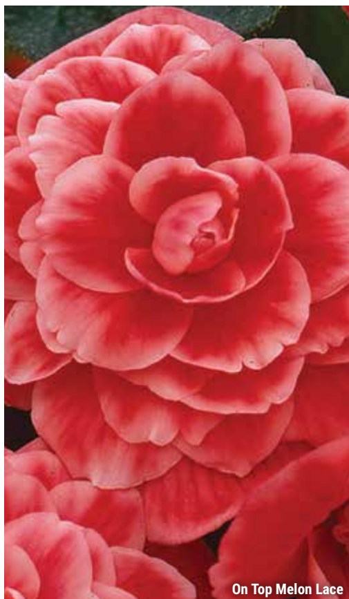
On Top Melon Lace