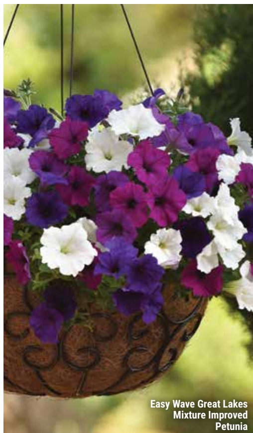
Easy Wave Great Lakes Mixture Improved Petunia