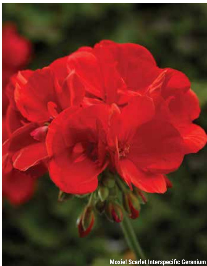
Moxie! Scarlet Interspecific Geranium