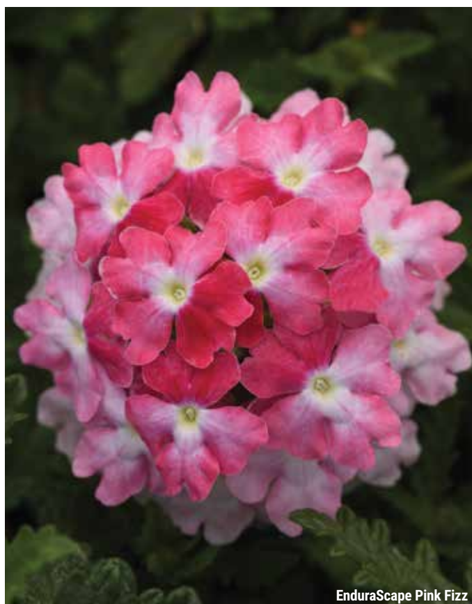
EnduraScape Pink Fizz