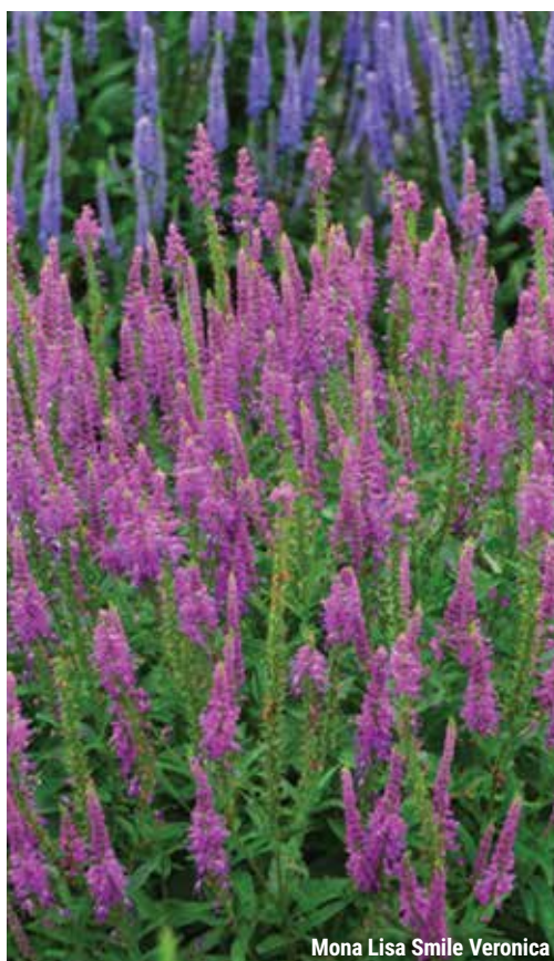
Mona Lisa Smile Veronica