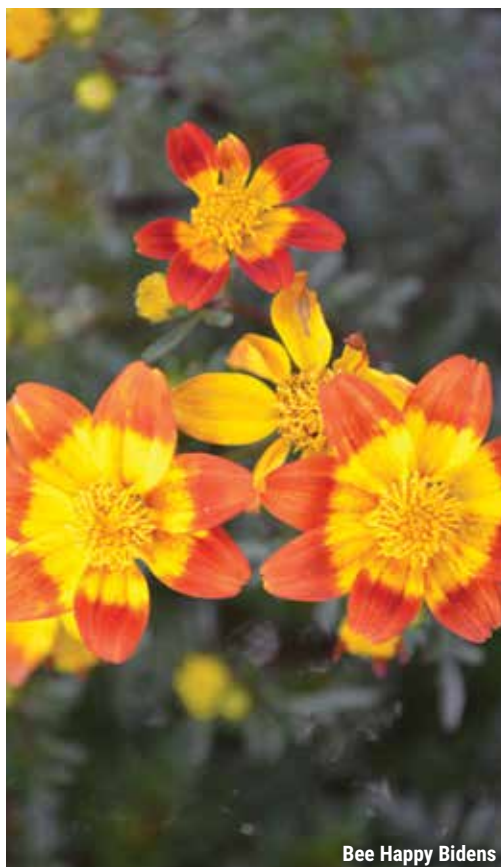
Bee Happy Bidens

50 to 70% more vigorous than Bee Alive, with a more upright habit than any red bicolor bidens on the market.