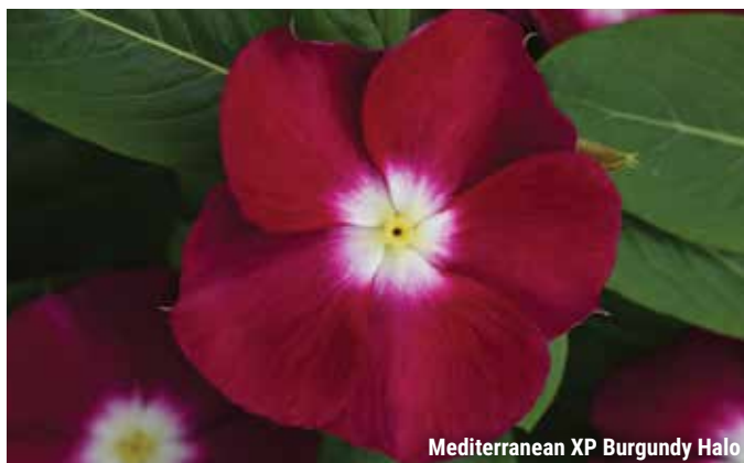
Mediterranean XP Burgundy Halo