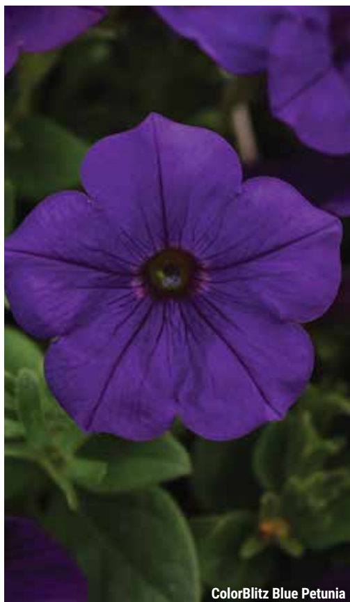
ColorBlitz Blue Petunia