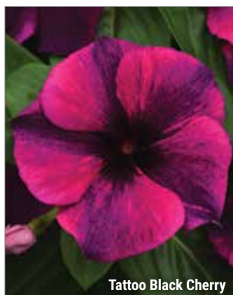
Tattoo Black Cherry