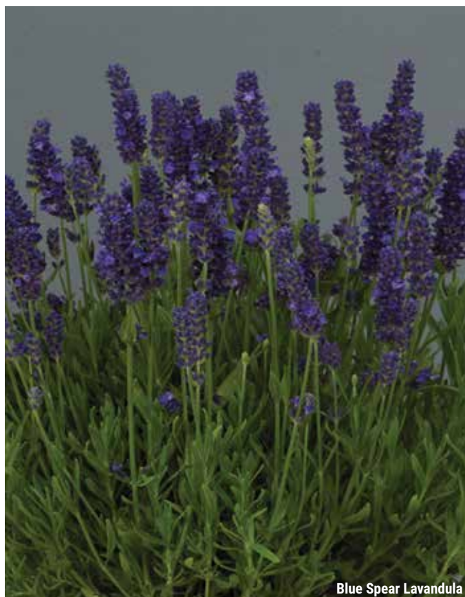
Blue Spear Lavandula