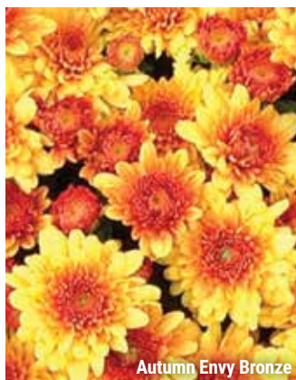
Autumn Envy Bronze

A Ball Ingenuity product, available exclusively through Ball Seed.