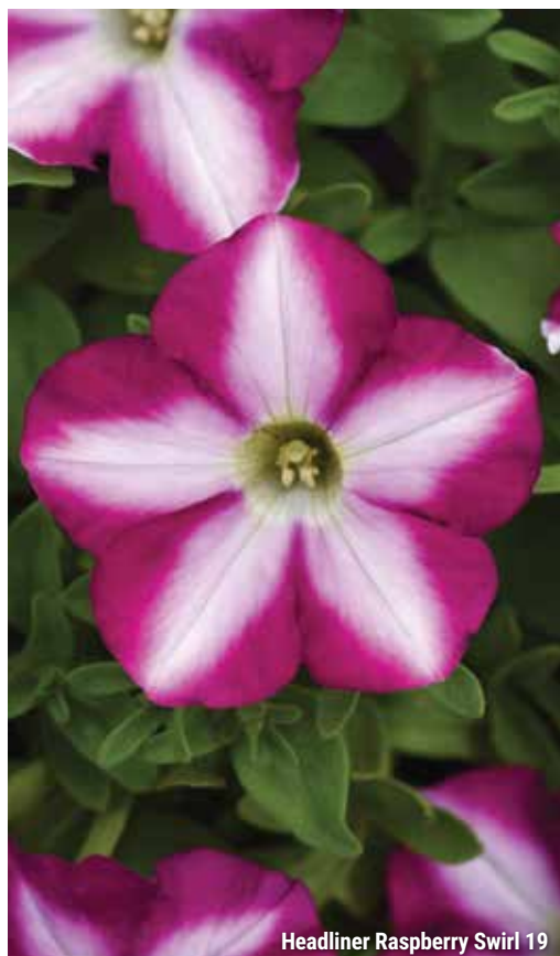
Headliner Raspberry Swirl 19