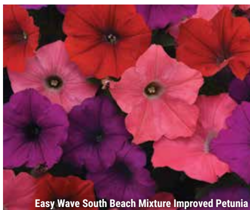
Easy Wave South Beach Mixture Improved Petunia