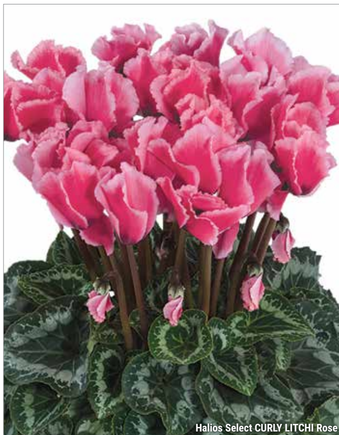
Halios Select CURLY LITCHI Rose