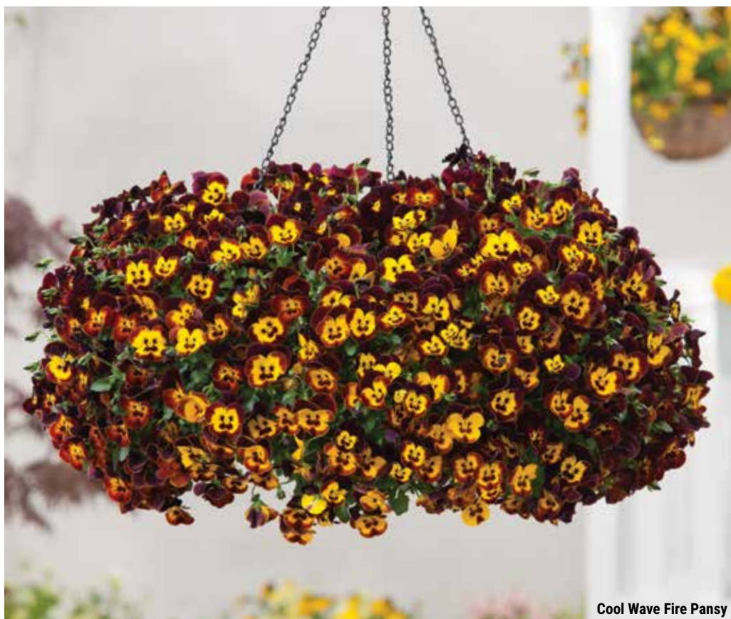
Cool Wave Fire Pansy