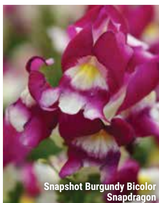
Snapshot Burgundy Bicolor Snapdragon