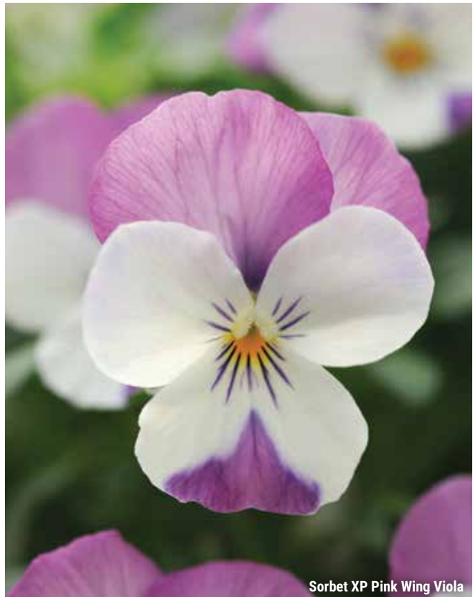
Sorbet XP Pink Wing Viola

Early, continuous-blooming plant performs well under both warm and cool conditions with high humidity.