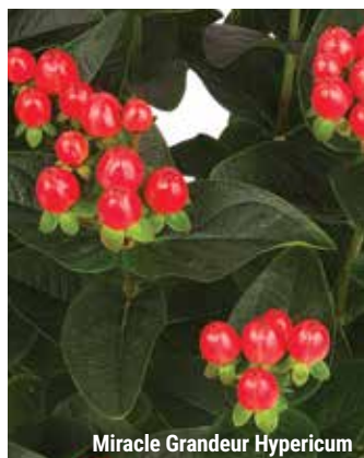
Miracle Grandeur Hypericum