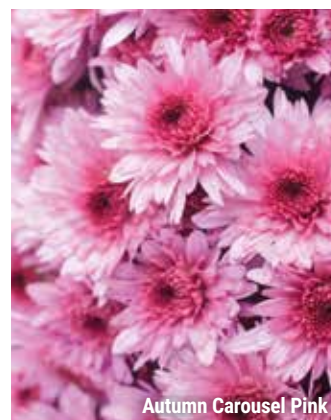
Autumn Carousel Pink