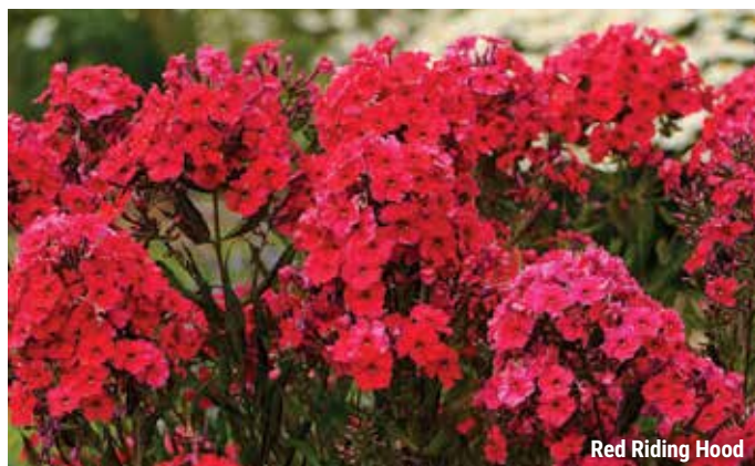
Red Riding Hood