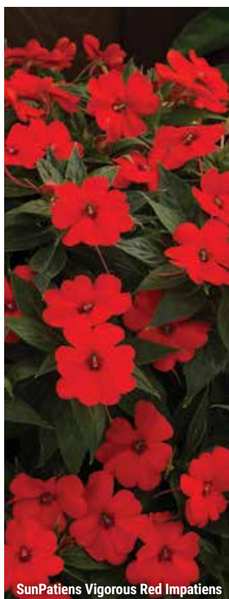
SunPatiens Vigorous Red Impatiens