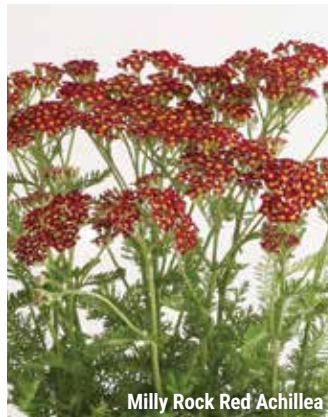
Milly Rock Red Achillea