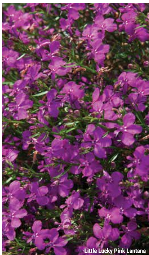
Little Lucky Pink Lantana