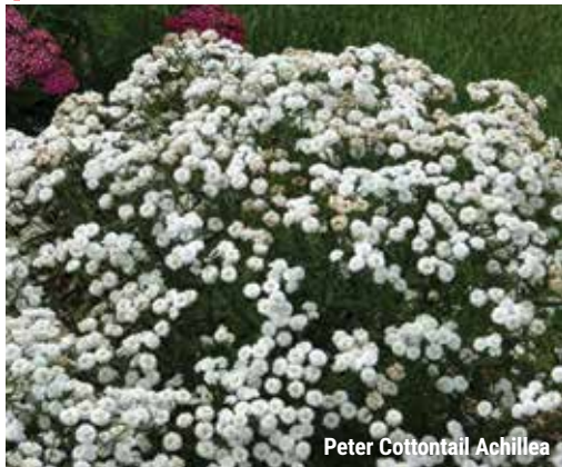
Peter Cottontail Achillea