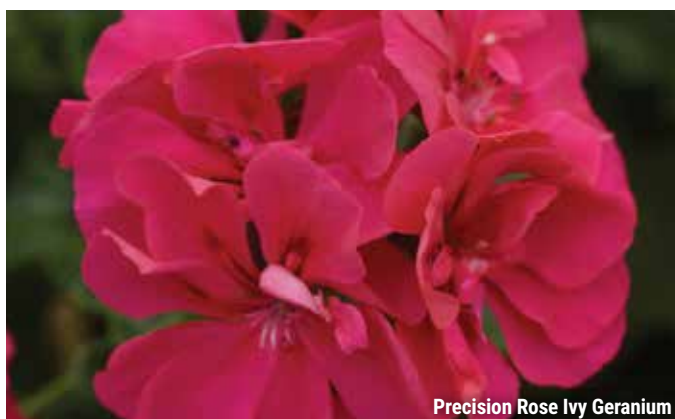
Precision Rose Ivy Geranium