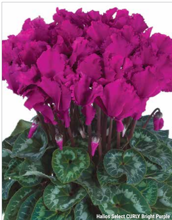
Halios Select CURLY Bright Purple