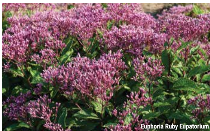
Euphoria Ruby Eupatorium