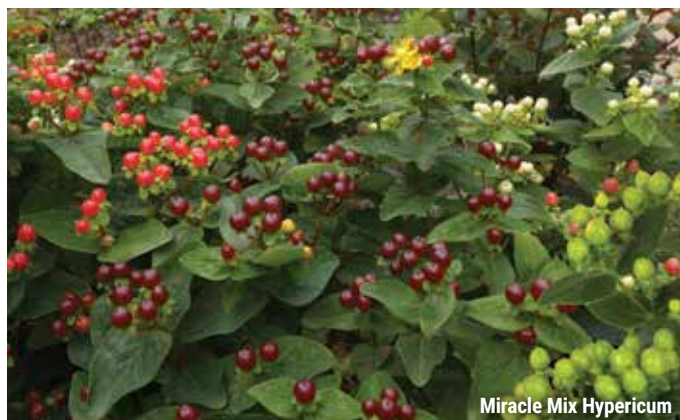
Miracle Mix Hypericum