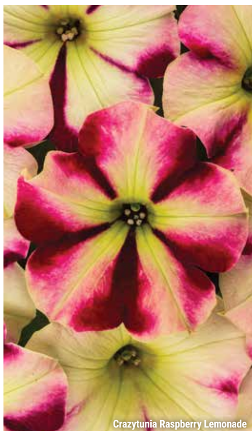
Crazytunia Raspberry Lemonade