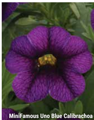
MiniFamous Uno Blue Calibrachoa