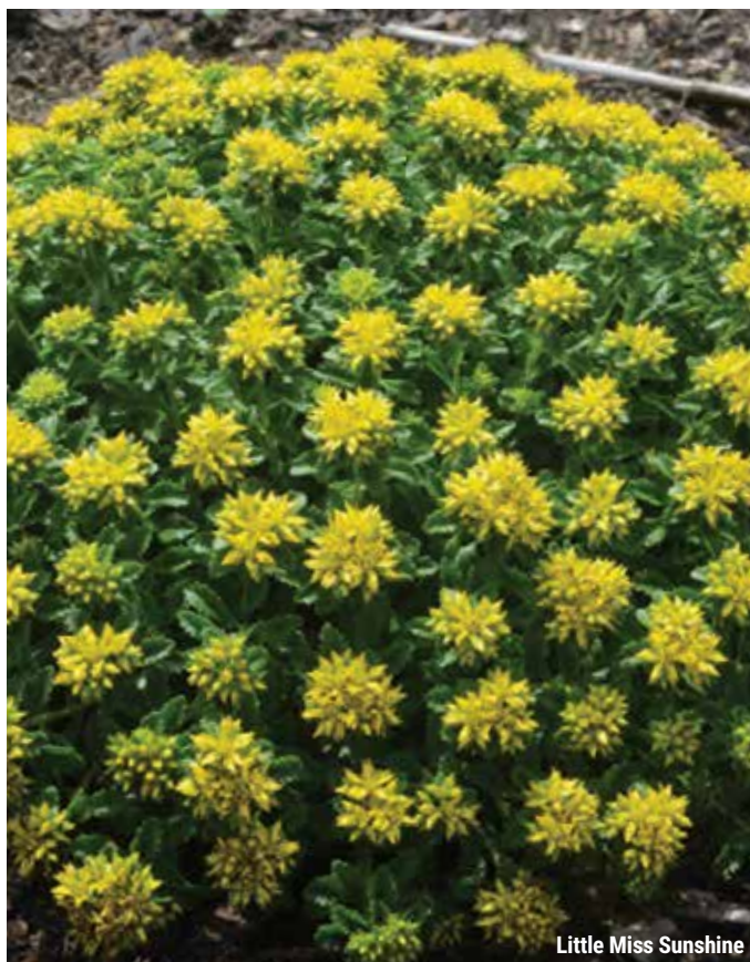
Little Miss Sunshine