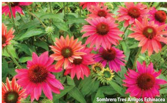
Sombrero Tres Amigos Echinacea