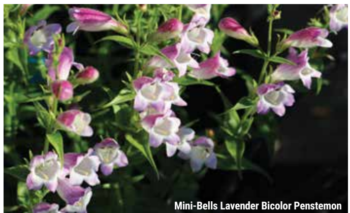
Mini-Bells Lavender Bicolor Penstemon