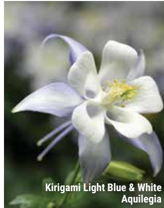
Kirigami Light Blue & White Aquilegia