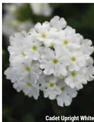
Cadet Upright White