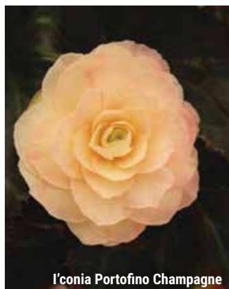
l'conia Portofino Champagne