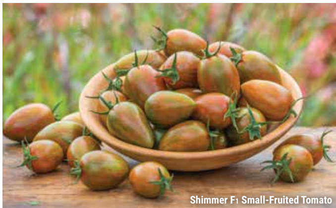
Shimmer F1 Small-Fruited Tomato

Mid-compact determinate plants produce early maturing, extra-large and firm red globe-shaped fruit.