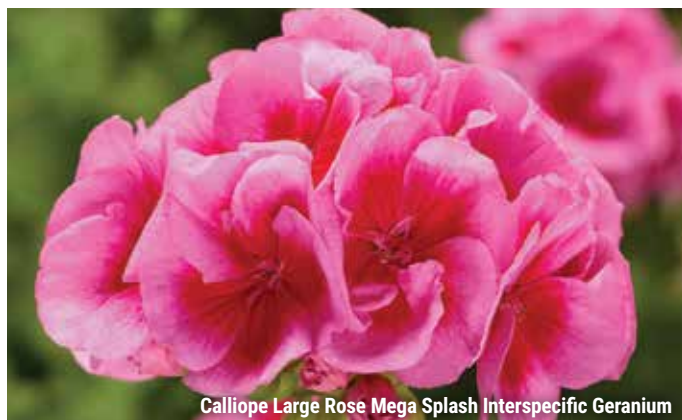
Calliope Large Rose Mega Splash Interspecific Geranium