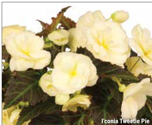
l'conia Tweetie Pie

Dümmen Orange® product, available exclusively through Ball Seed.