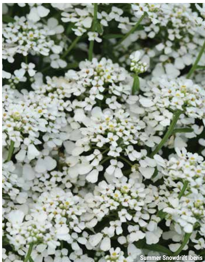
Summer Snowdrift Iberis

Glossy, bold purple leaves are scalloped with charcoal veining accents and rosy pink calyxes that hold white flowers.