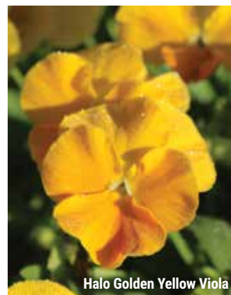
Halo Golden Yellow Viola