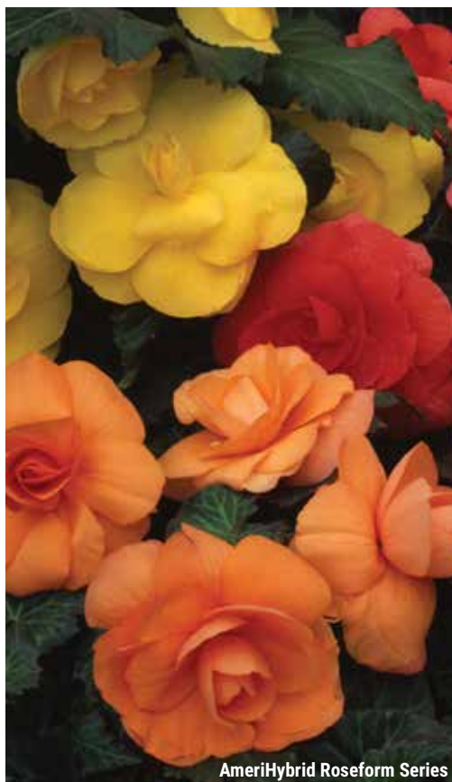
AmeriHybrid Roseform Series