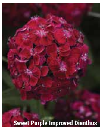
Sweet Purple Improved Dianthus