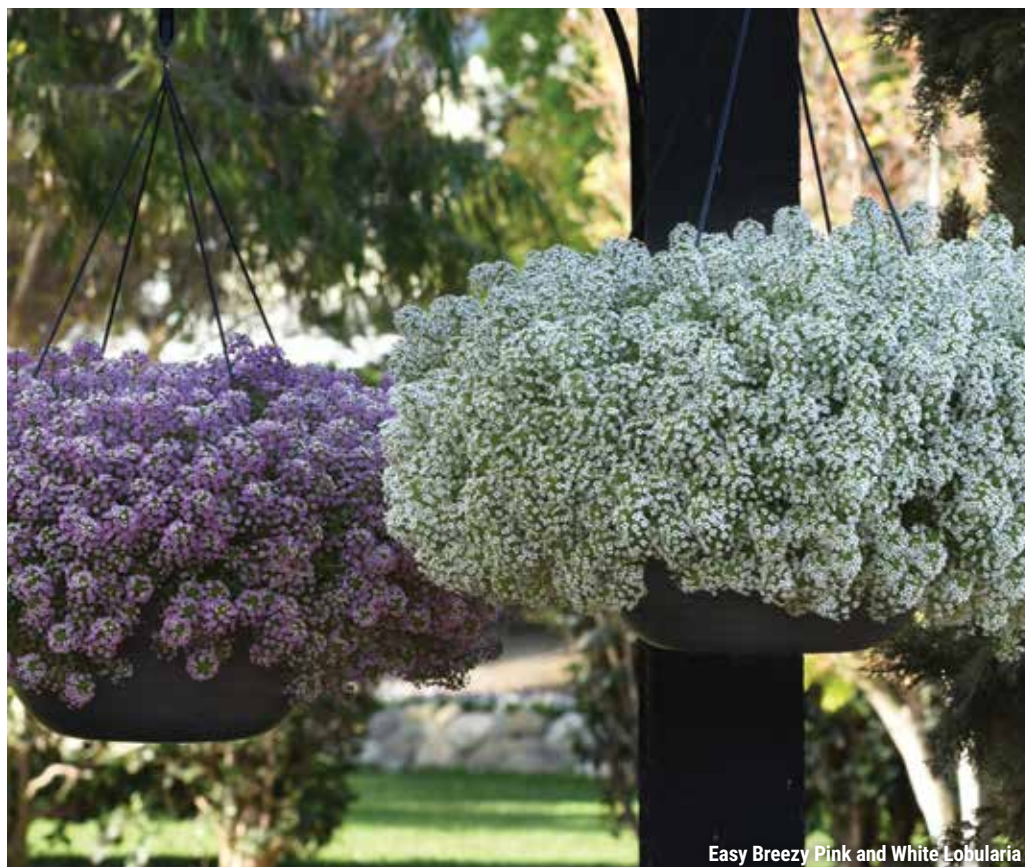
Easy Breezy Pink and White Lobularia

Features more solid dark purple with a smaller eye than the original, with good branching and more controlled growth. Selecta One®