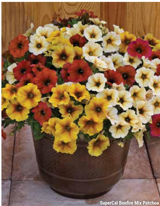
SuperCal Bonfire Mix Petchoa