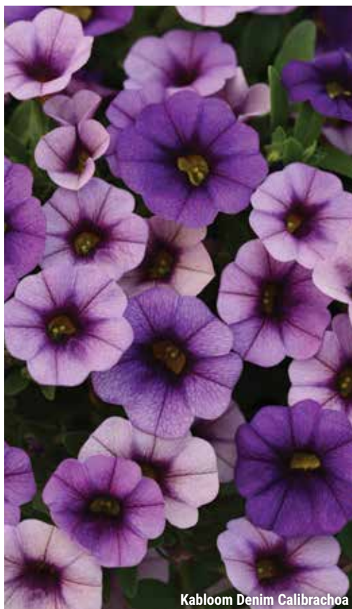
Kabloom Denim Calibrachoa