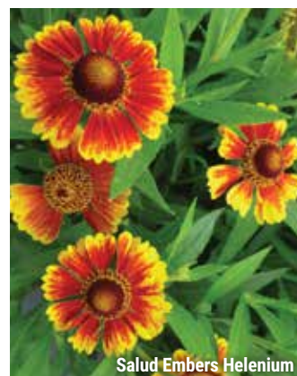
Salud Embers Helenium