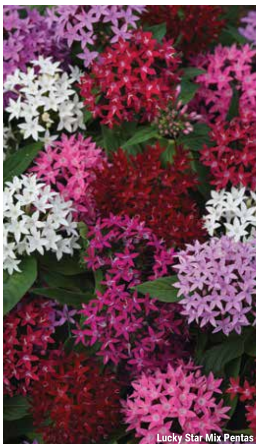
Lucky Star Mix Pentas