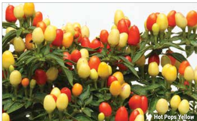
Hot Pops Yellow