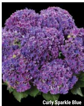
Curly Sparkle Blue