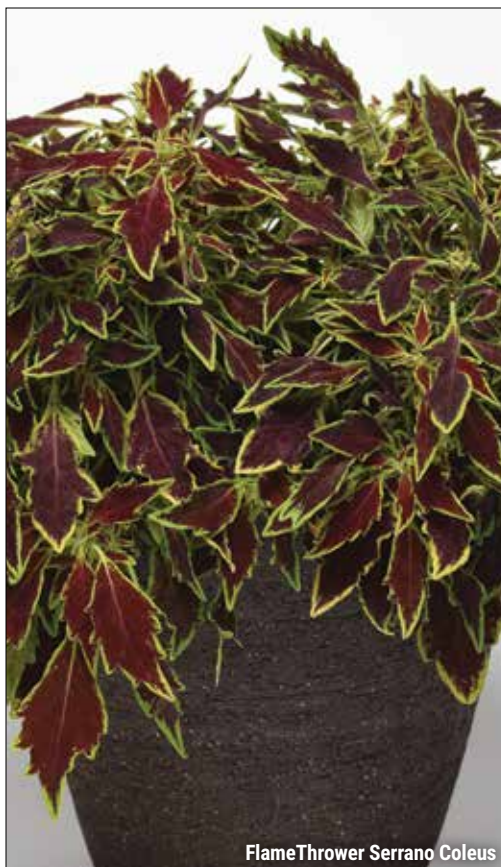
FlameThrower Serrano Coleus

Compact to medium coleus is perfect for quarts and mixed containers.