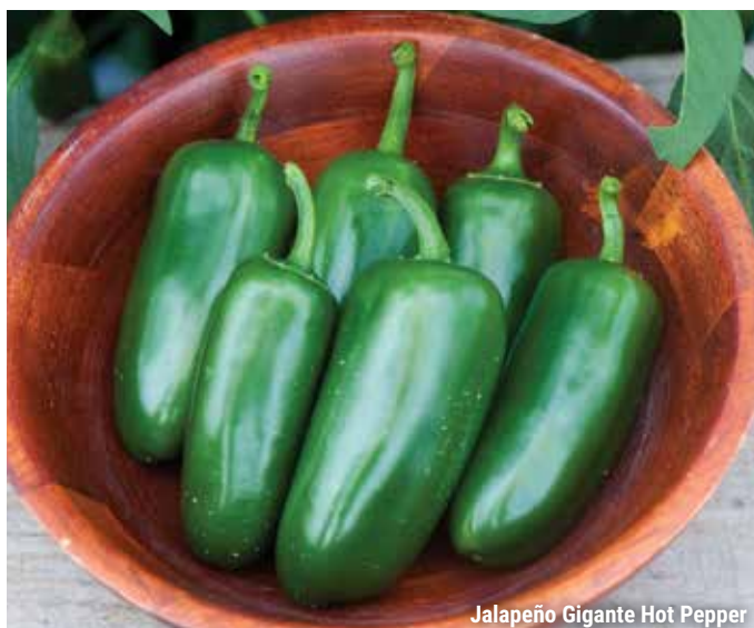
Jalapeño Gigante Hot Pepper