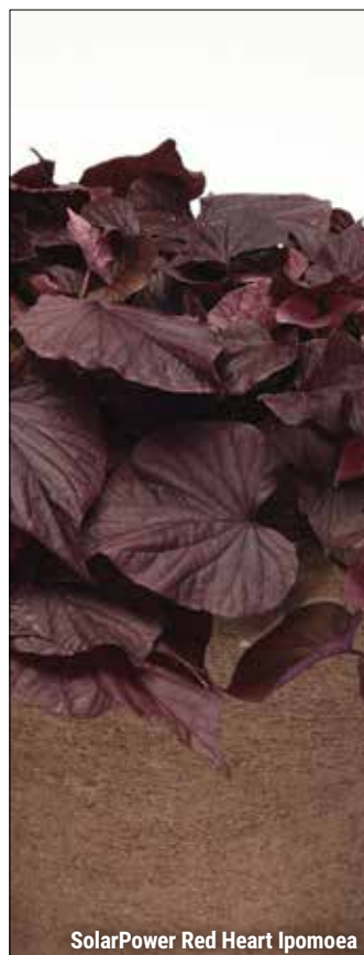
SolarPower Red Heart Ipomoea