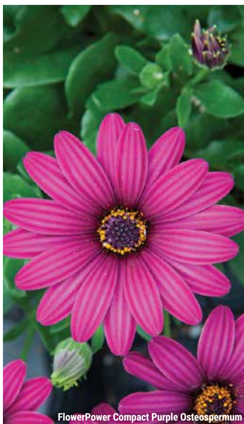
FlowerPower Compact Purple Osteospermum