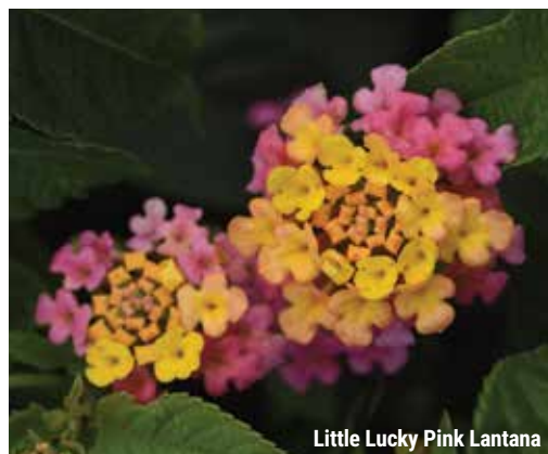
Little Lucky Pink Lantana