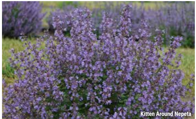
Kitten Around Nepeta