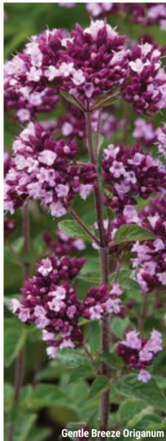
Gentle Breeze Origanum