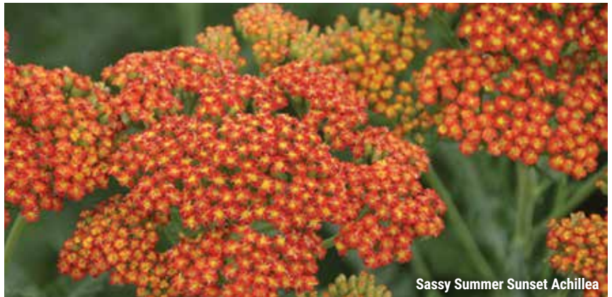
Sassy Summer Sunset Achillea