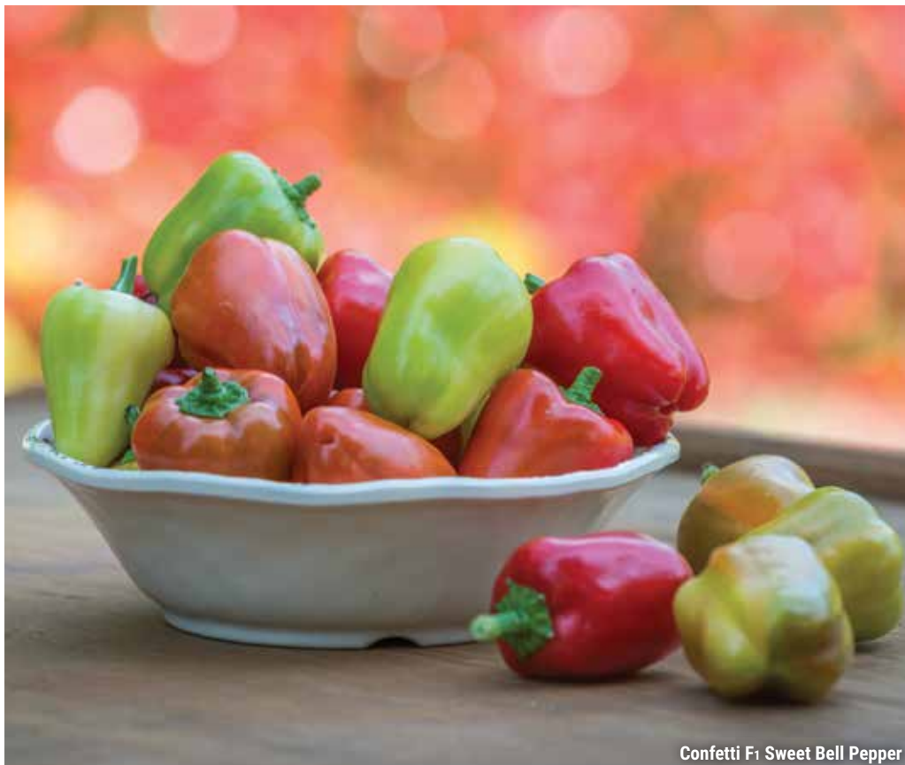
Confetti F 1 Sweet Bell Pepper

CLEANLEAF trait results in healthier foliage for longer-lasting garden performance.