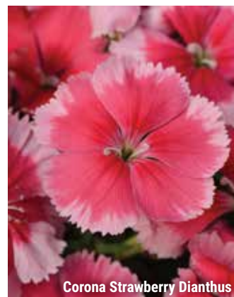
Corona Strawberry Dianthus