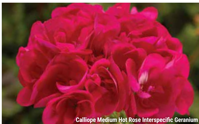
Calliope Medium Hot Rose Interspecific Geranium