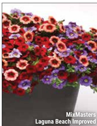
MixMasters Laguna Beach Improved