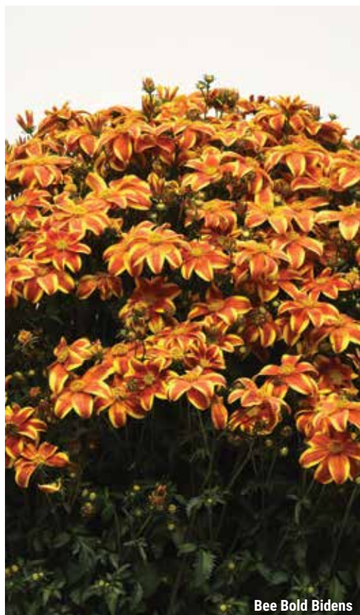
Bee Bold Bidens