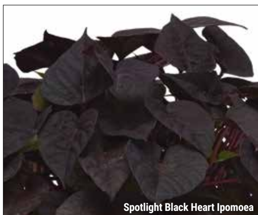
Spotlight Black Heart Ipomoea