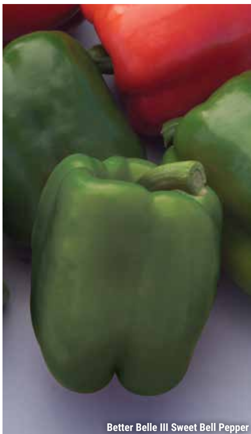
Better Belle III Sweet Bell Pepper