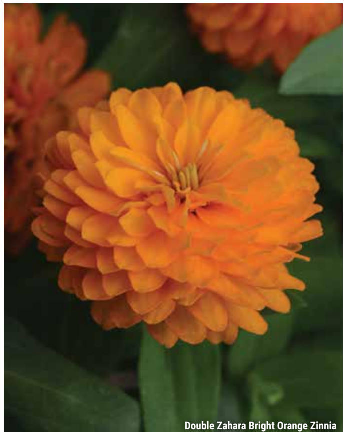
Double Zahara Bright Orange Zinnia