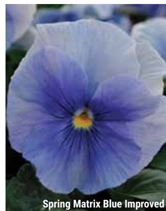
Spring Matrix Blue Improved