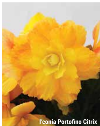
l'conia Portofino Citrix