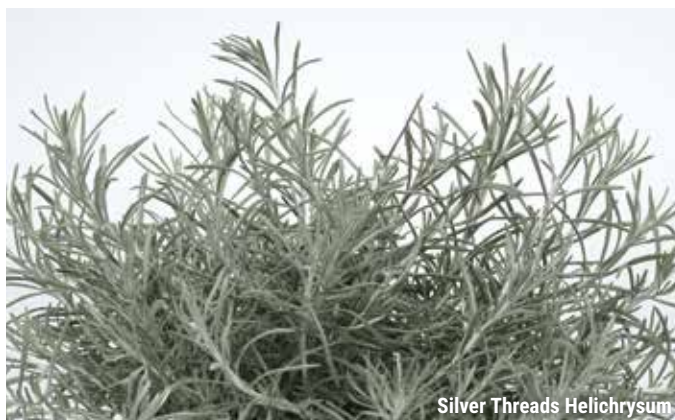
Silver Threads Helichrysum