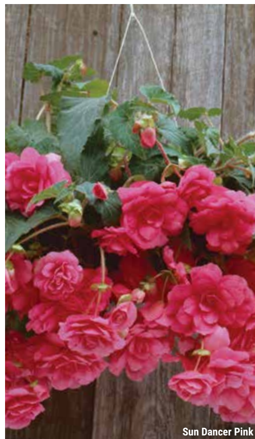
Sun Dancer Pink