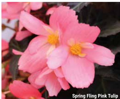
Spring Fling Pink Tulip