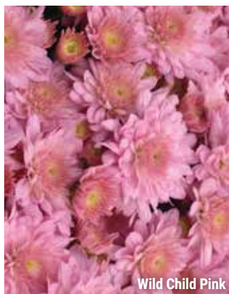
Wild Child Pink