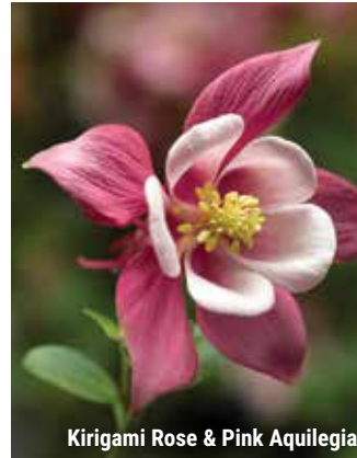
Kirigami Rose & Pink Aquilegia