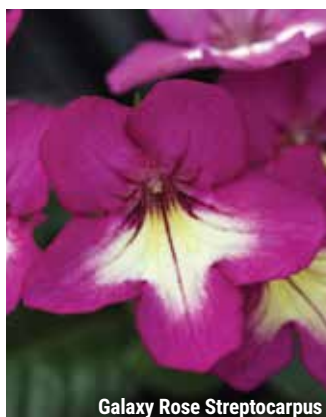
Galaxy Rose Streptocarpus