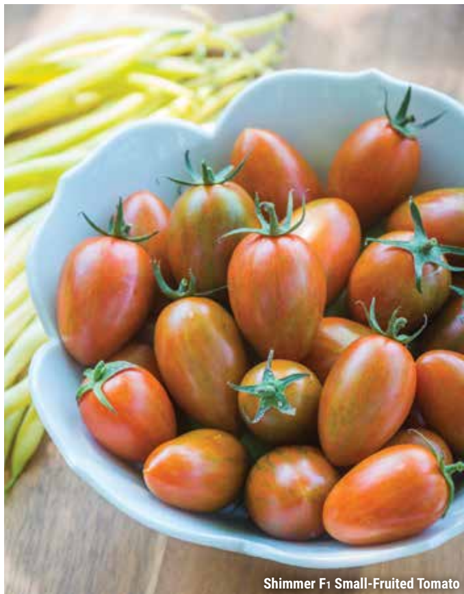
Shimmer F1 Small-Fruited Tomato

2018 All-America Selections National Award Winner.