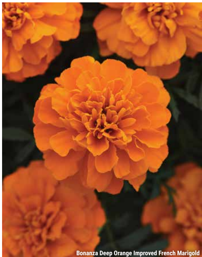
Bonanza Deep Orange Improved French Marigold