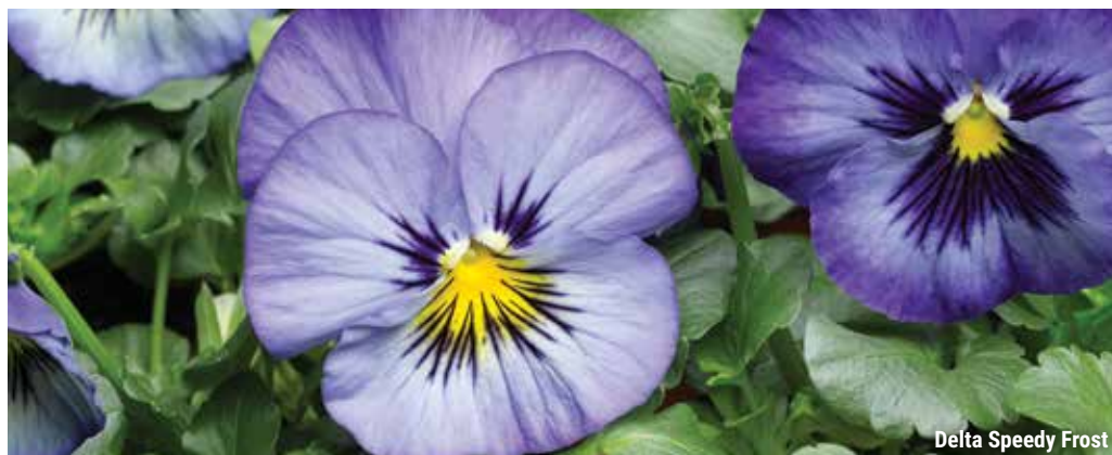
Delta Speedy Frost