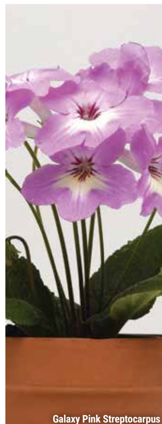
Galaxy Pink Streptocarpus