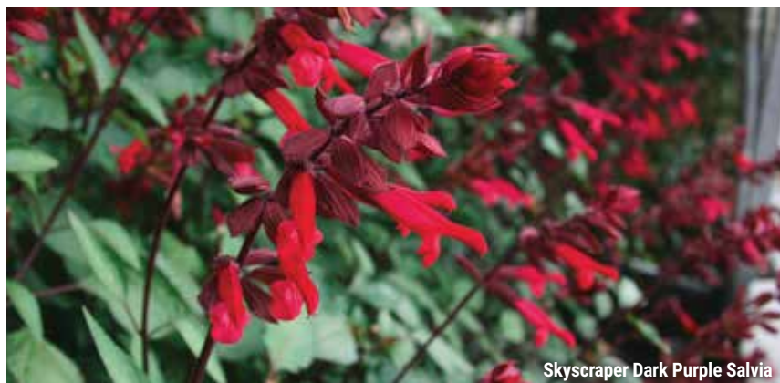
Skyscraper Dark Purple Salvia