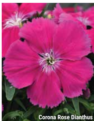
Corona Rose Dianthus