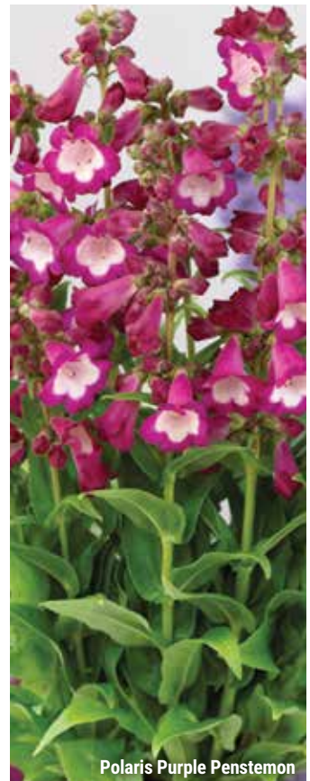
Polaris Purple Penstemon