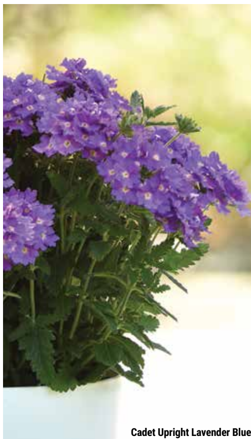
Cadet Upright Lavender Blue