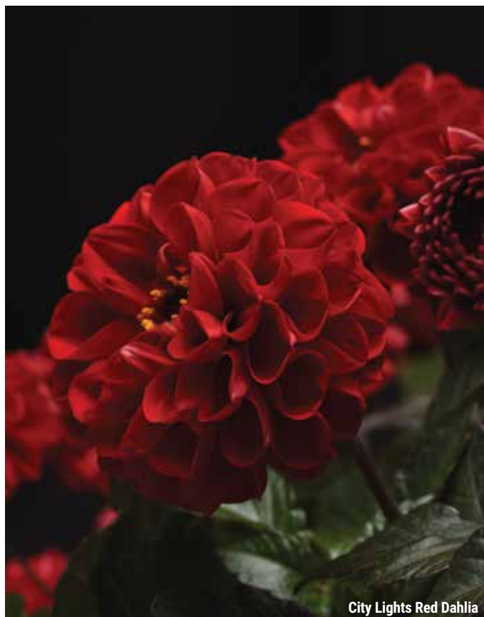
City Lights Red Dahlia