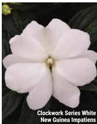
Clockwork Series White New Guinea Impatiens