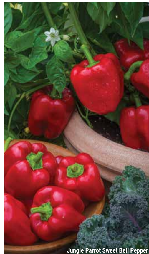
Jungle Parrot Sweet Bell Pepper

Ball WebTrack® helps keep all your documents in order and your business running like clockwork...for free. Save time and organize your documents at ballseed.com/webtrack .