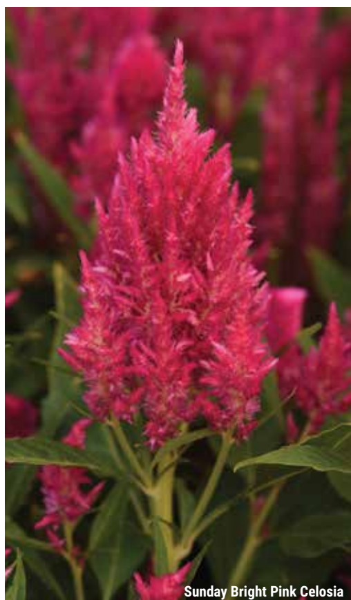
Sunday Bright Pink Celosia

Basal-branching plants produce 13-in. (33-cm) plumes.