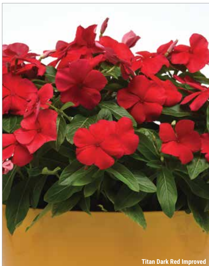
Titan Dark Red Improved

Lots of fragrant flowers top upright, true green-leaved plants that are early and uniform blooming, with approximately 55% double flowers.