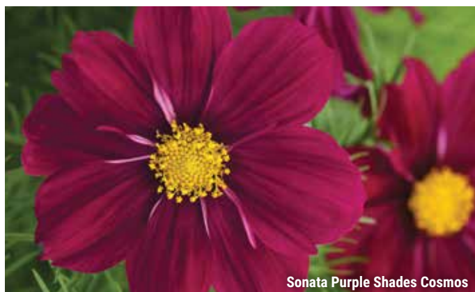
Sonata Purple Shades Cosmos