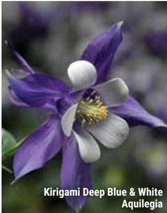
Kirigami Deep Blue & White Aquilegia