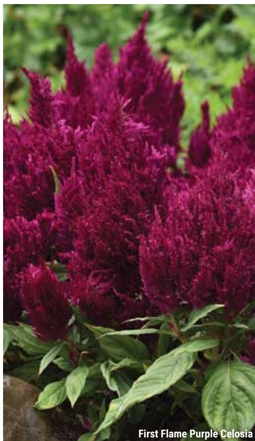
First Flame Purple Celosia