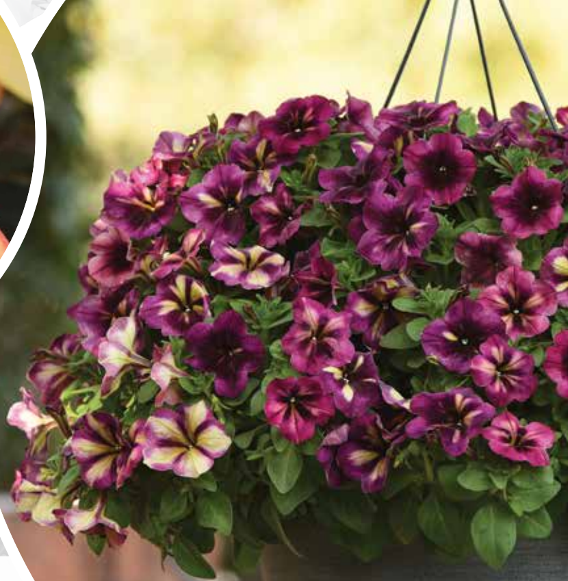
Jelly Roll Petunia