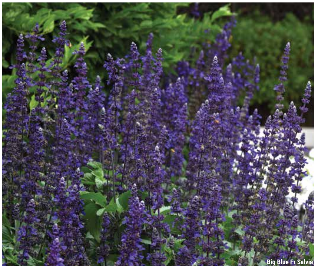
Big Blue F1 Salvia

Features unique double "butterfly" flowers that are ideal for early Spring and Fall color bowls.