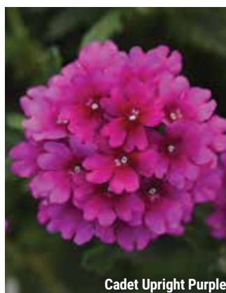
Cadet Upright Purple