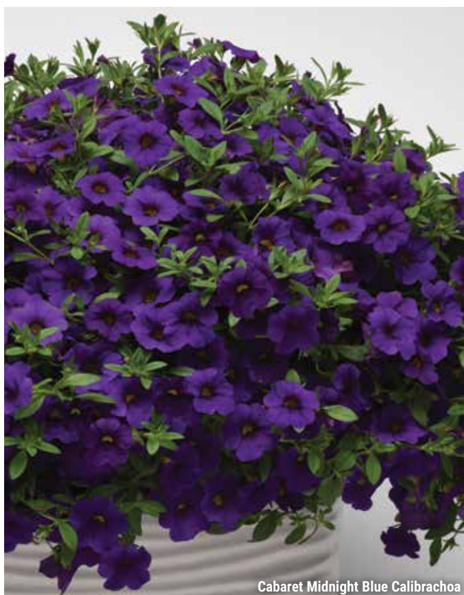
Cabaret Midnight Blue Calibrachoa