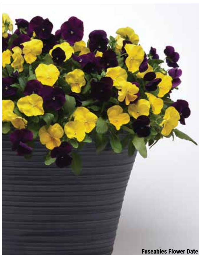
Fuseables Flower Date