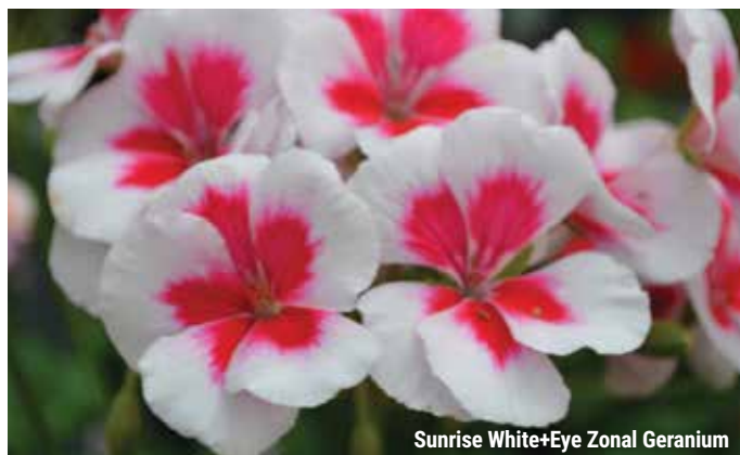
Sunrise White+Eye Zonal Geranium