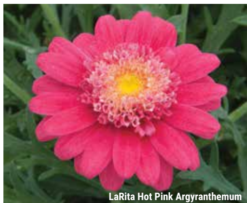
LaRita Hot Pink Argyanthemum