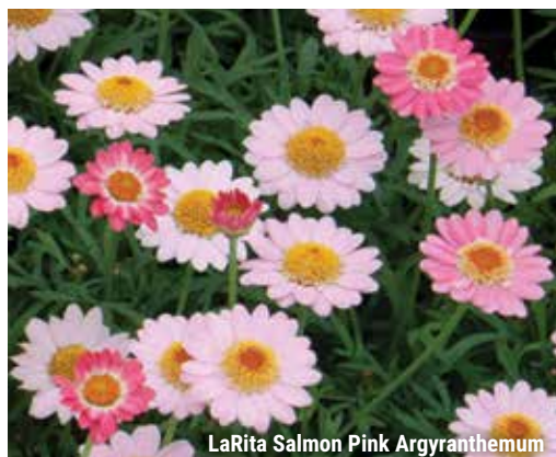
LaRita Salmon Pink Argyanthemum