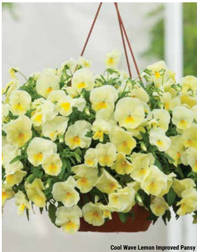
Cool Wave Lemon Improved Pansy