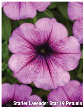
Starlet Lavender Star 19 Petunia

A Ball Ingenuity product, available exclusively through Ball Seed.