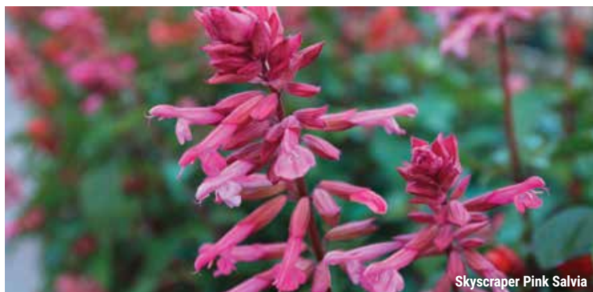
Skyscraper Pink Salvia