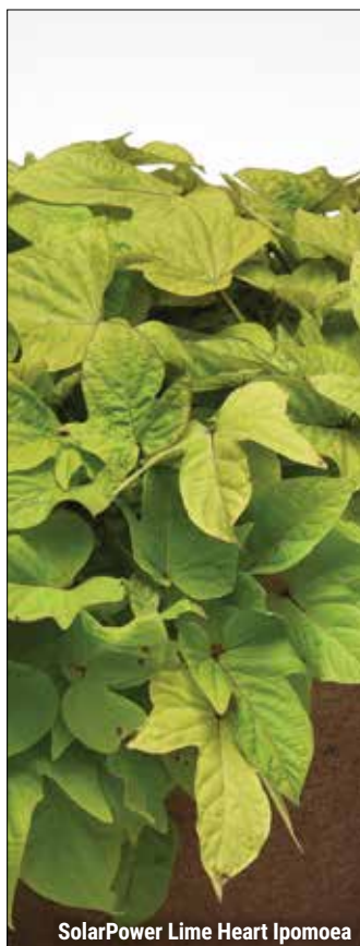
SolarPower Lime Heart Ipomoea