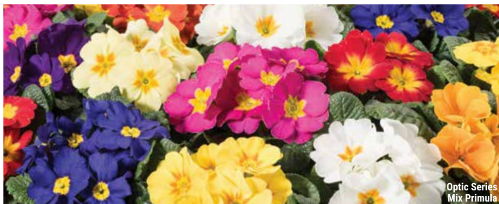
Optic Series Mix Primula