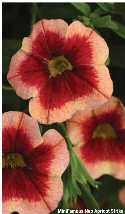
MiniFamous Neo Apricot Strike