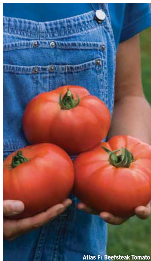
Atlas F1 Beefsteak Tomato