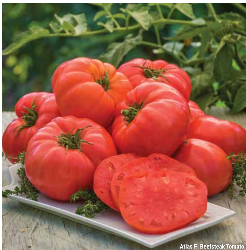
Atlas F1 Beefsteak Tomato

This compact pink beefsteak tomato plant offers outstanding heirloom flavor with uniform fruits.