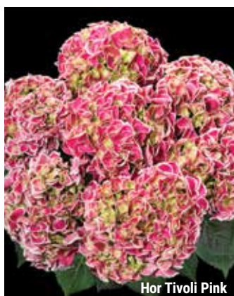
Hor Tivoli Pink