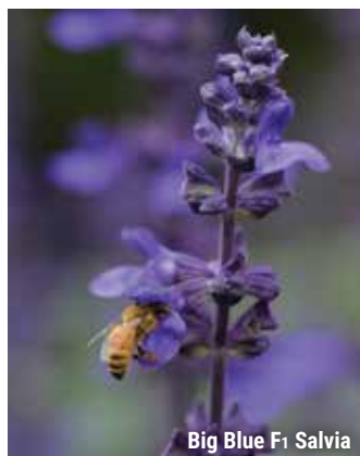
Big Blue F1 Salvia