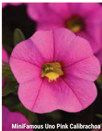
MiniFamous Uno Pink Calibrachoa

Early to flower and compact, this series offers novel flower forms and uniform timing for quarts and smaller hanging baskets.