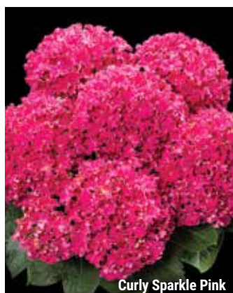
Curly Sparkle Pink