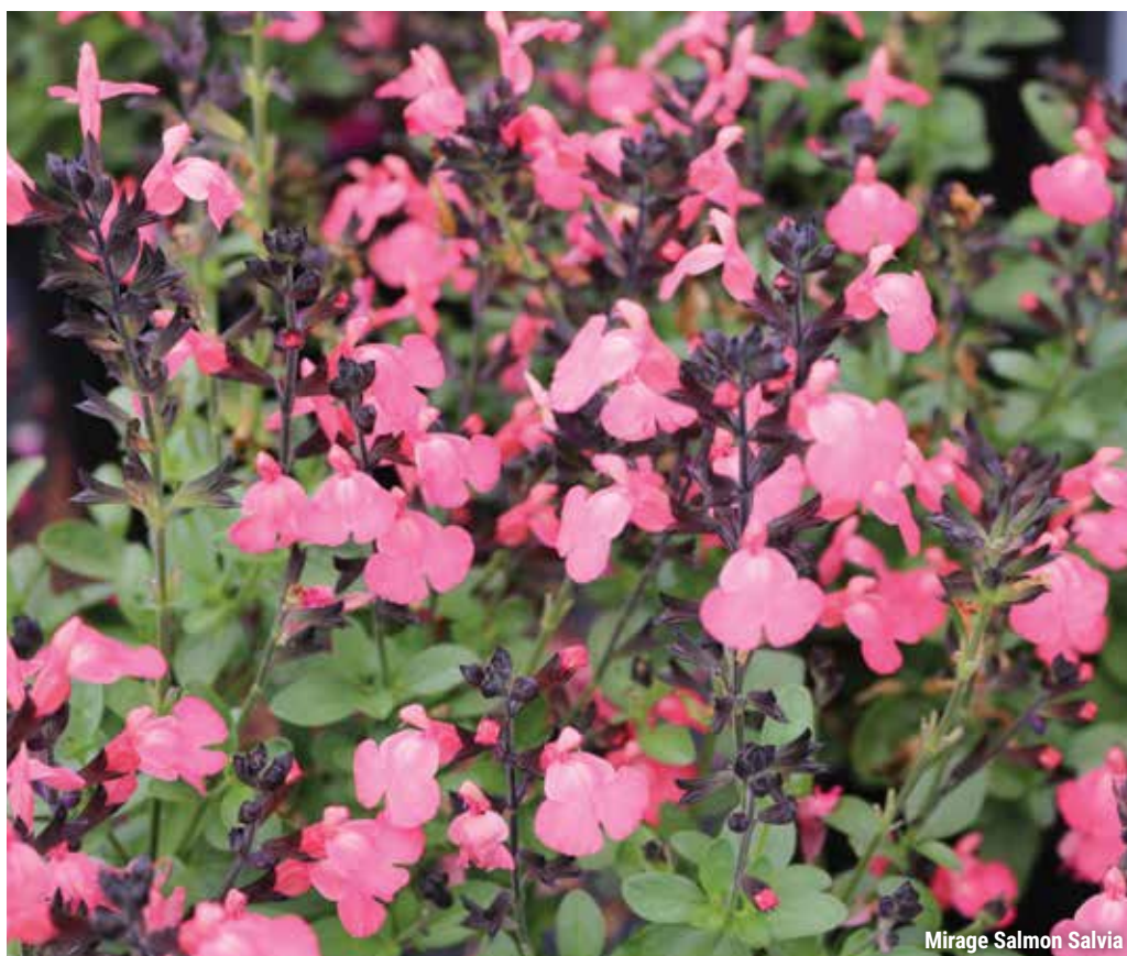
Mirage Salmon Salvia