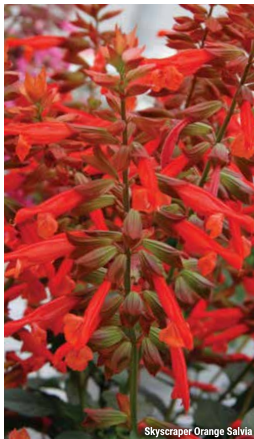
Skyscraper Orange Salvia