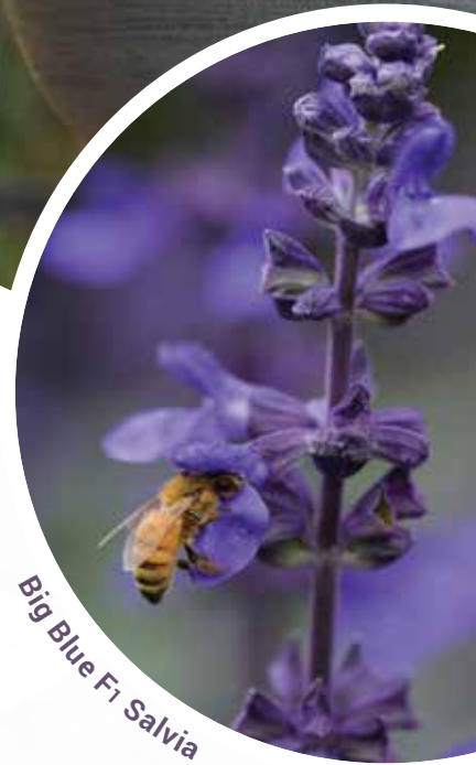
Big Blue F1 Salvia