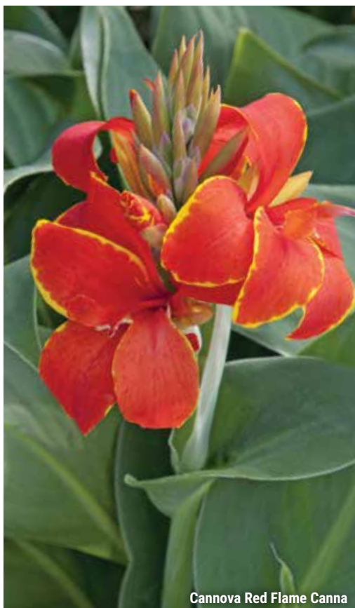
Cannova Red Flame Canna