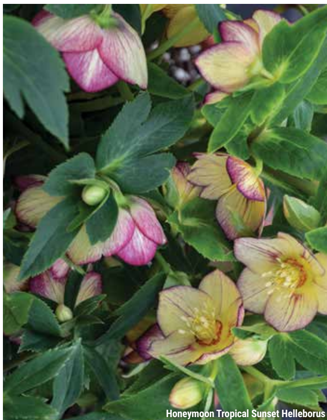
Honeymoon Tropical Sunset Helleborus