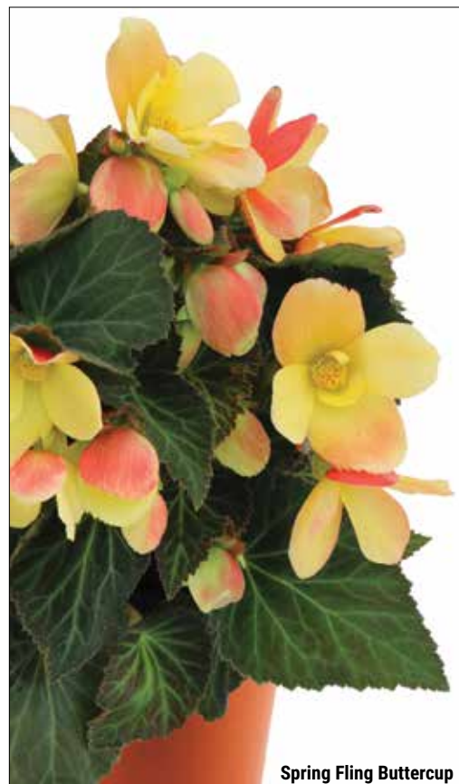
Spring Fling Buttercup