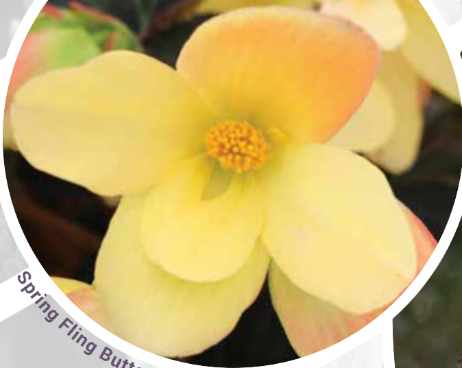
Spring Fling Buttercup Begonia