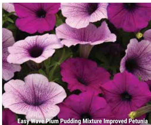
Easy Wave Plum Pudding Mixture Improved Petunia