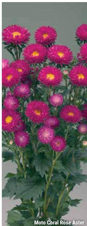
Moto Coral Rose Aster