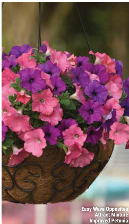
Easy Wave Opposites Attract Mixture Improved Petunia