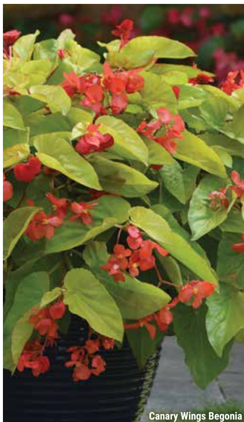
Canary Wings Begonia