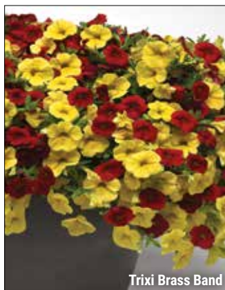
Trixi Brass Band