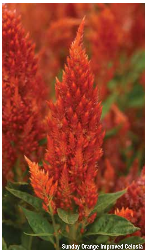
Sunday Orange Improved Celosia