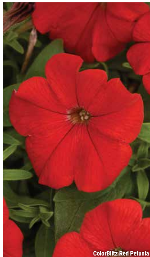
ColorBlitz Red Petunia