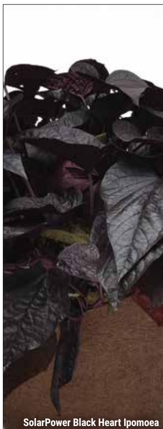
SolarPower Black Heart Ipomoea