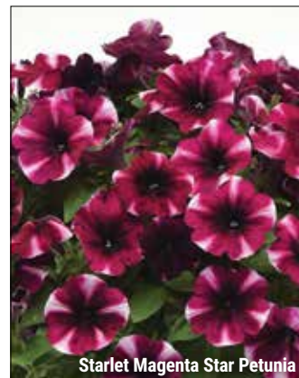
Starlet Magenta Star Petunia