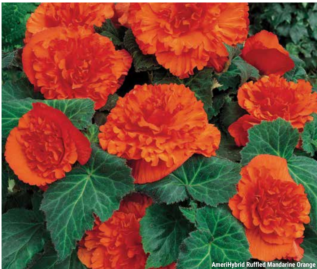
AmeriHybrid Ruffled Mandarin Orange