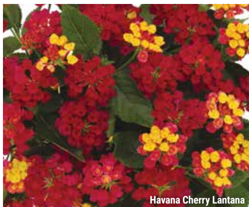
Havana Cherry Lantana