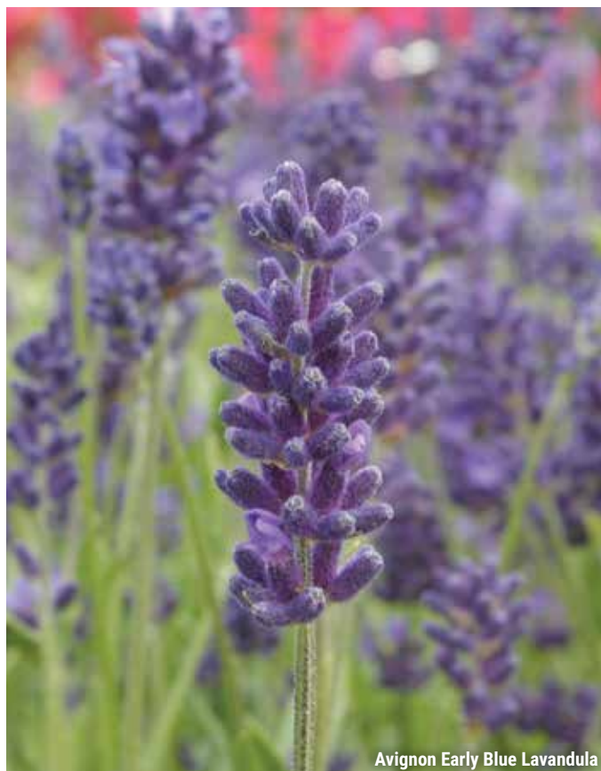
Avignon Early Blue Lavandula

Lush green foliage forms a dense, moss-like carpet that's perfect for planting between paving stones or on rock walls, bordering a garden or body of water, or serving as groundcover. Zones 4-9