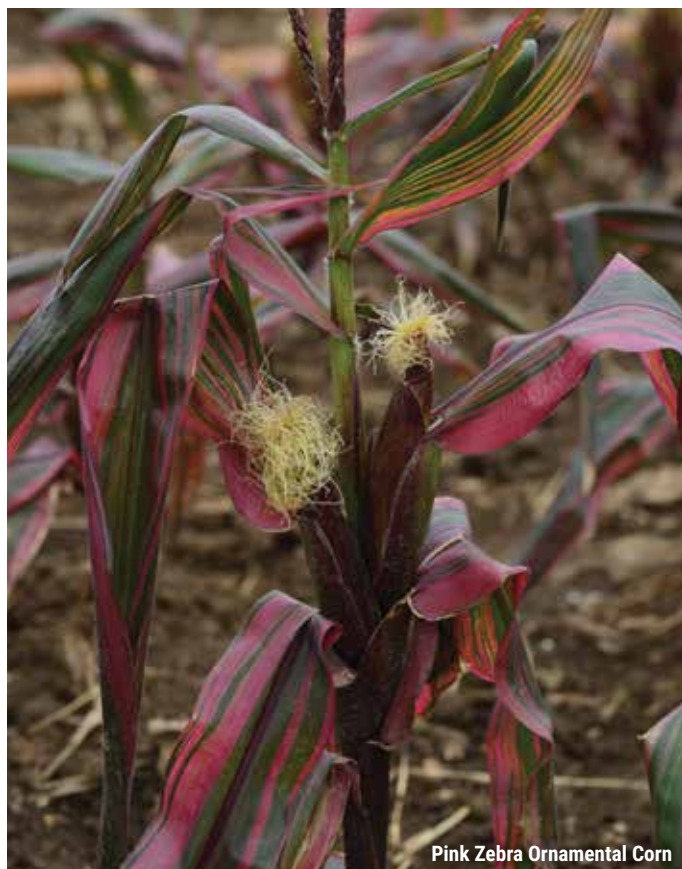
Pink Zebra Ornamental Corn