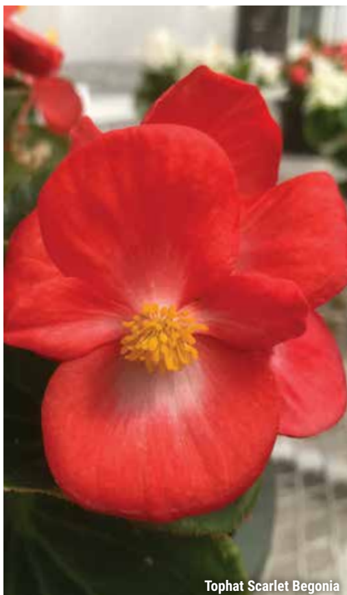
Tophat Scarlet Begonia