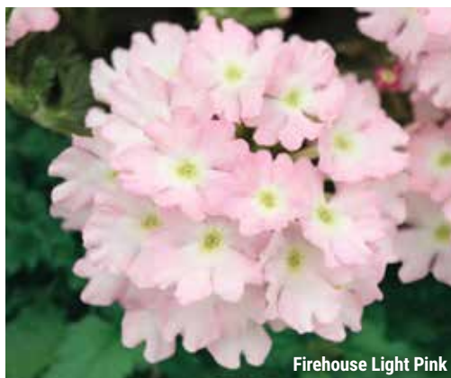
Firehouse Light Pink