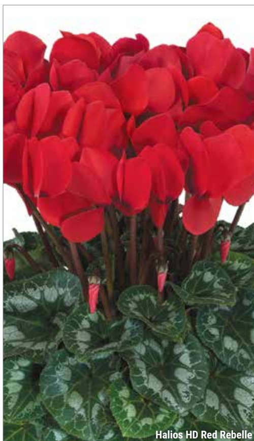
Halios HD Red Rebelle