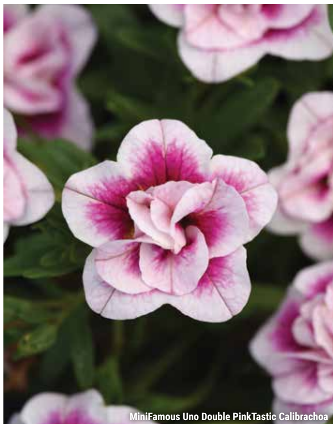
MiniFamous Uno Double PinkTastic Calibrachoa