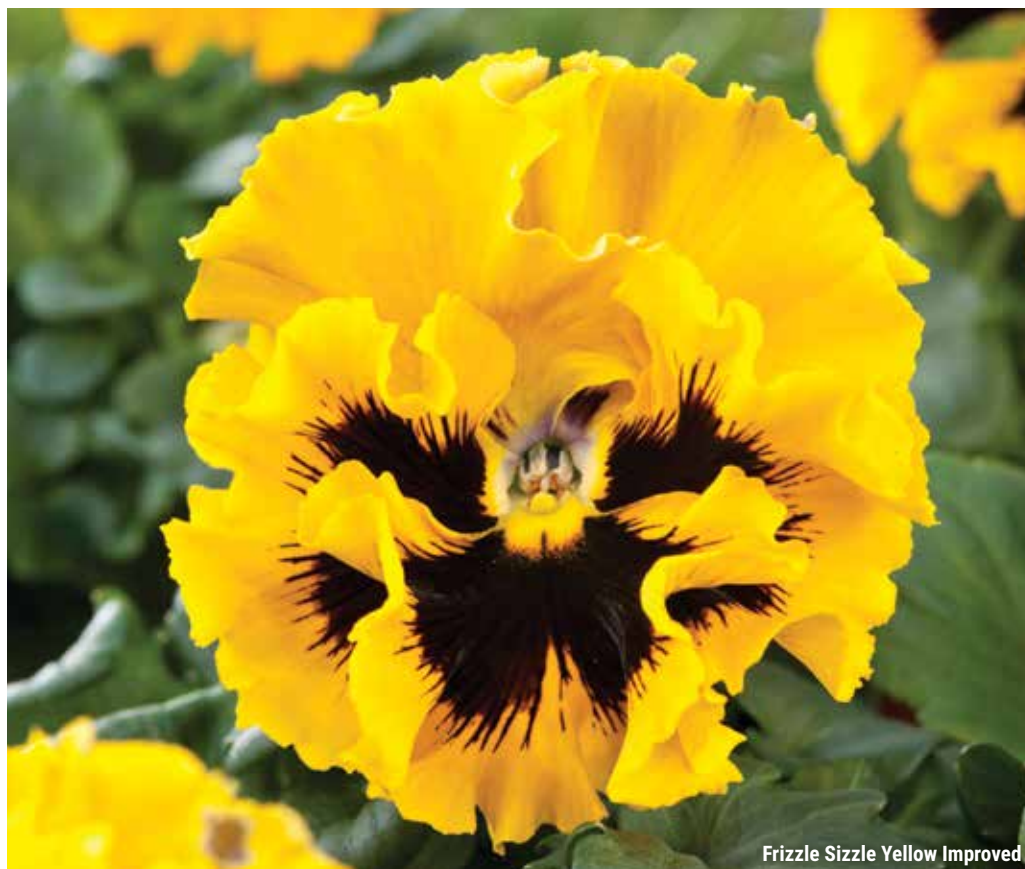
Frizzle Sizzle Yellow Improved

Delivers the tightest bloom window of any Spring-flowering pansy, across a full color range, with the most uniform habit and least stretch of any Spring pansy.