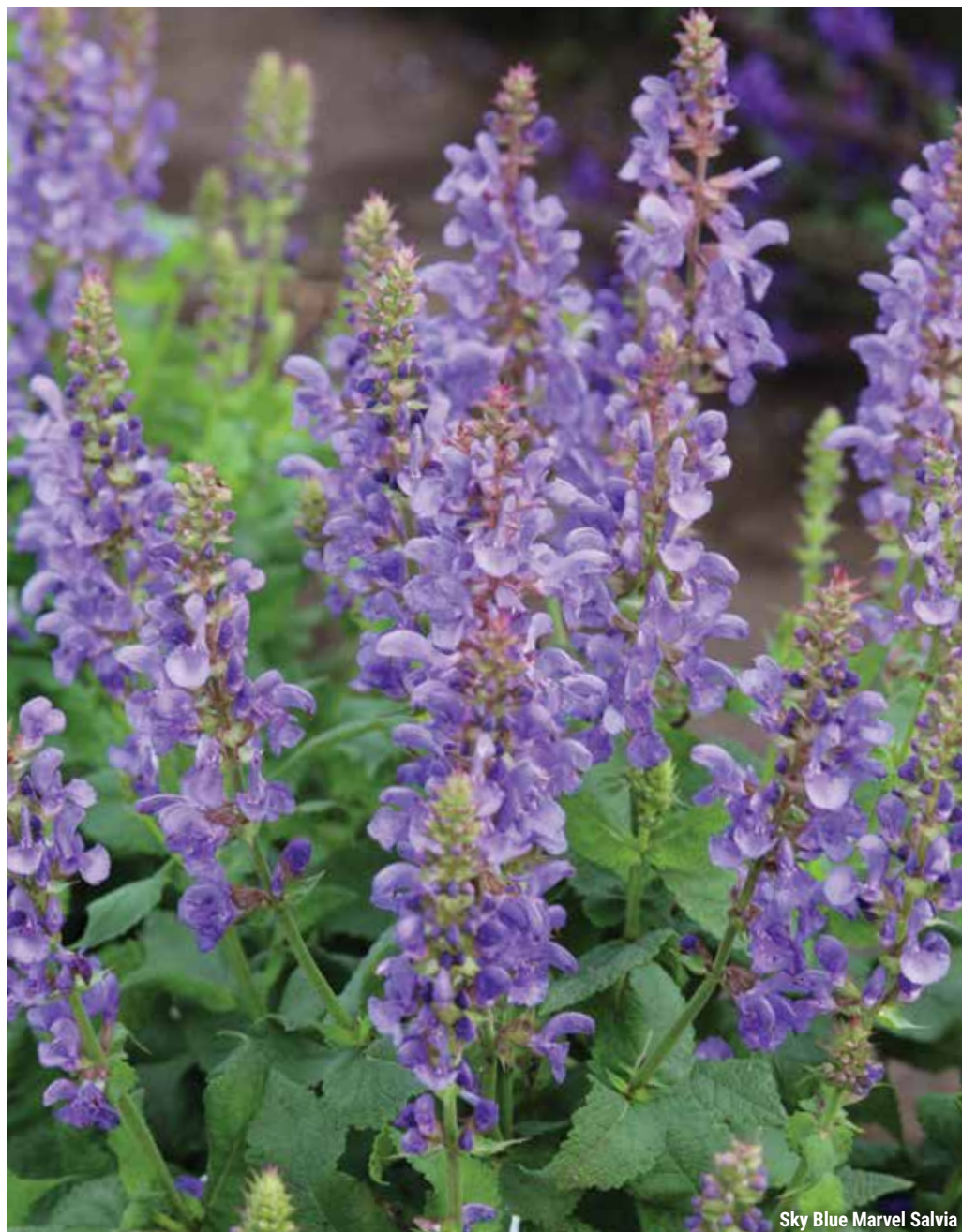
Sky Blue Marvel Salvia