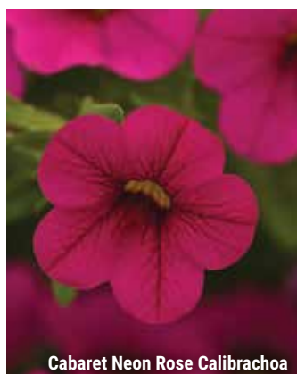
Cabaret Neon Rose Calibrachoa