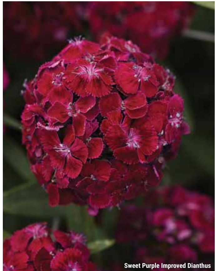
Sweet Purple Improved Dianthus

Show-stopping 2018 All-America Selections National Winner is highlighted by its unique color – the flowers evolve from dark coral/peach/orange to light peach with a dark center as they age.