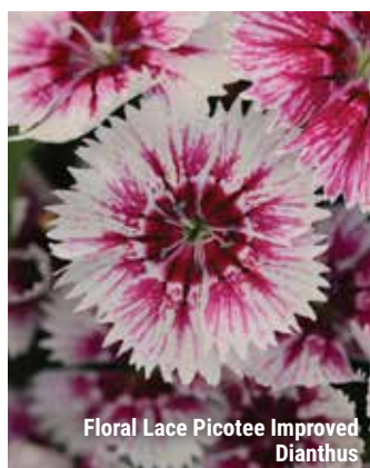
Floral Lace Picotee Improved Dianthus