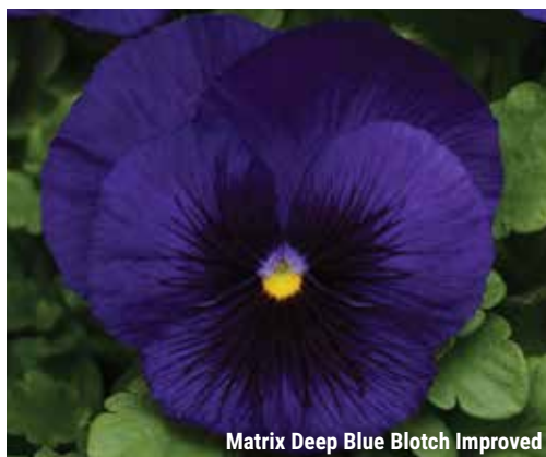
Matrix Deep Blue Blotch Improved