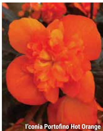
l'conia Portofino Hot Orange