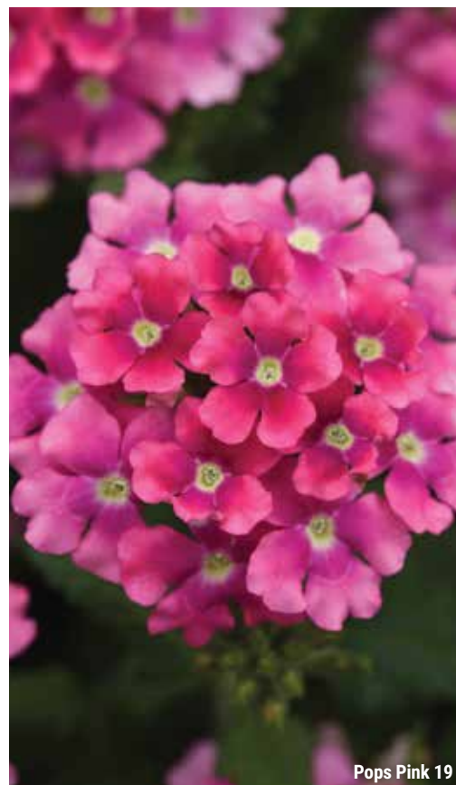
Pops Pink 19