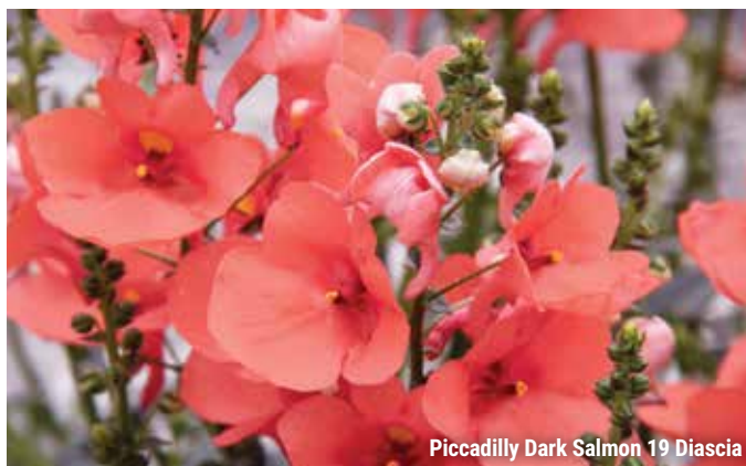
Piccadilly Dark Salmon 19 Diascia

This easy-to-grow, evergreen, low-growing, dense succulent offers attractive foliage, plus it is low maintenance, deer resistant, and drought and salt tolerant.