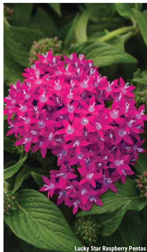
Lucky Star Raspberry Pentas