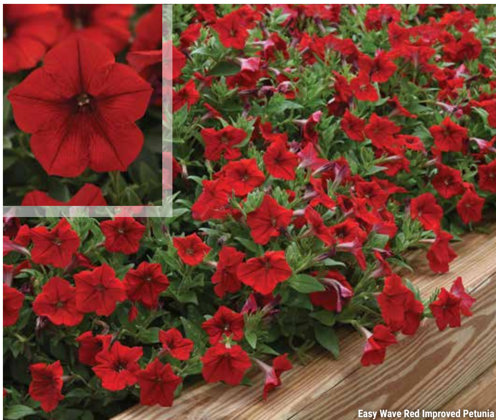
Easy Wave Red Improved Petunia