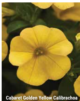
Cabaret Golden Yellow Calibrachoa