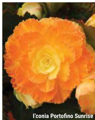
l'conia Portofino Sunrise