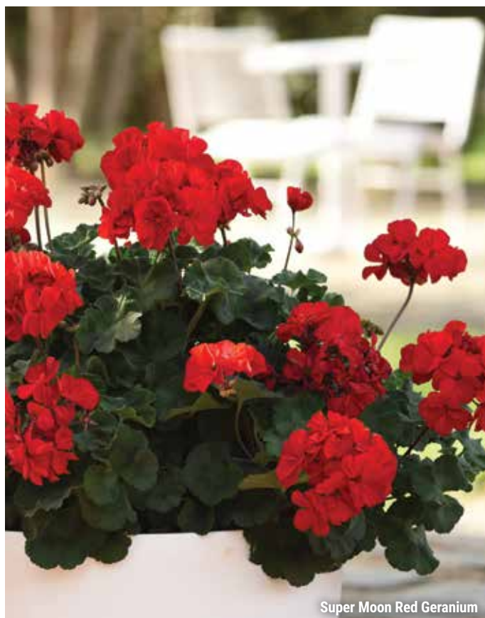
Super Moon Red Geranium