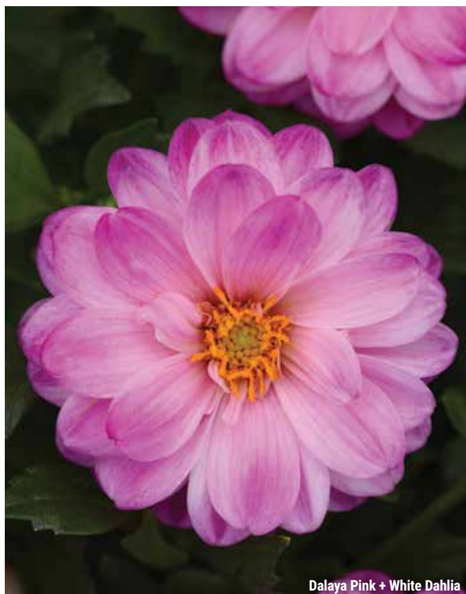
Dalaya Pink + White Dahlia