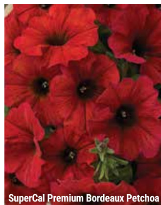
SuperCal Premium Bordeaux Petchoa