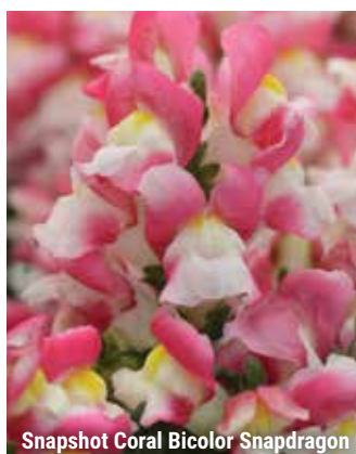
Snapshot Coral Bicolor Snapdragon