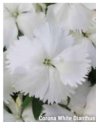
Corona White Dianthus