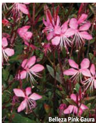
Belleza Pink Gaura