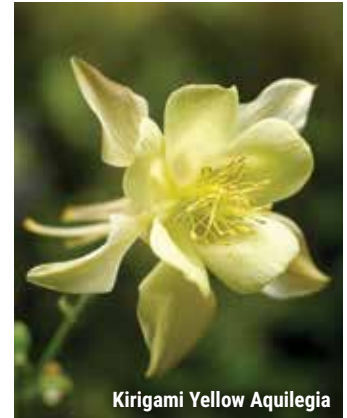
Kirigami Yellow Aquilegia