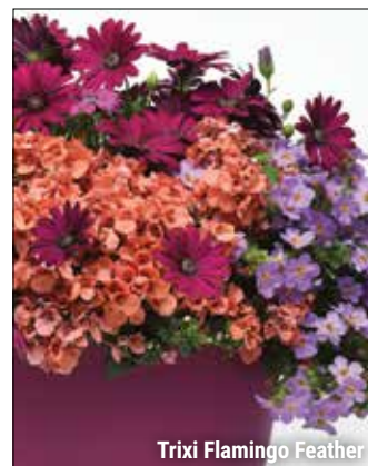
Trixi Flamingo Feather