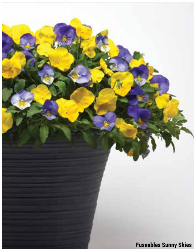
Fuseables Sunny Skies