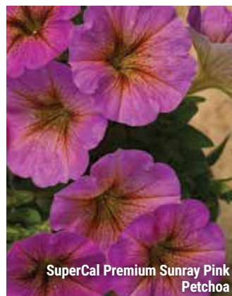
SuperCal Premium Sunray Pink Petchoa