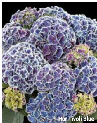
Hor Tivoli Blue