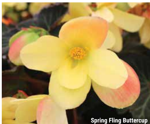
Spring Fling Buttercup