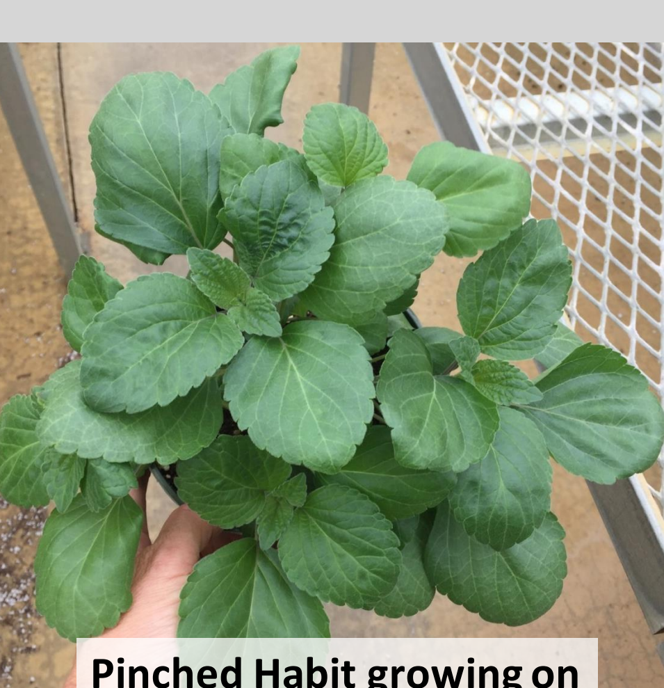
Pinched Habit growing on