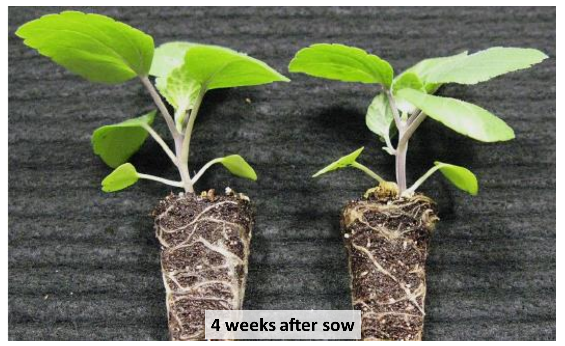
PGR 1-2 times in plug