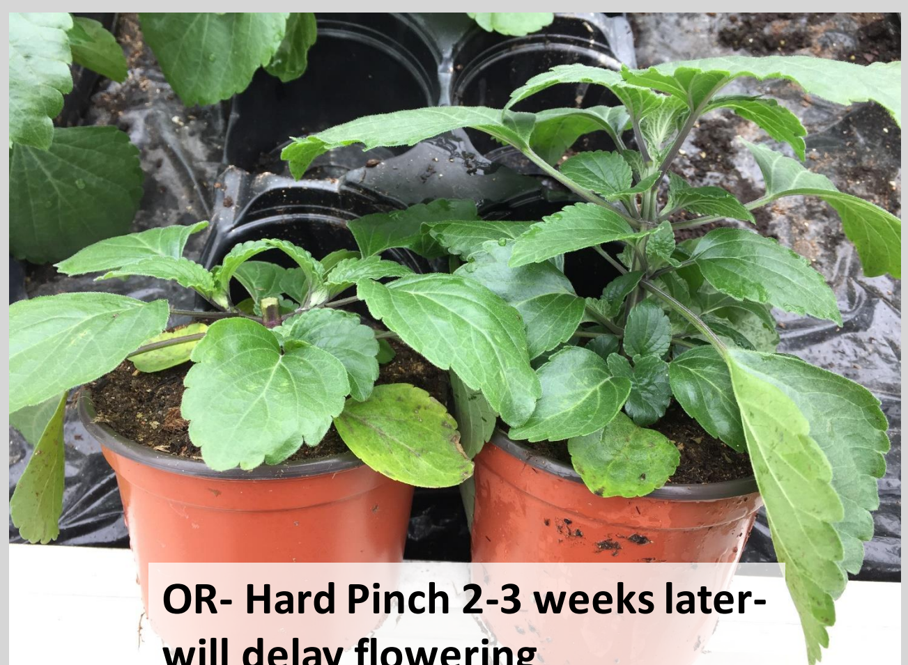
will delay flowering