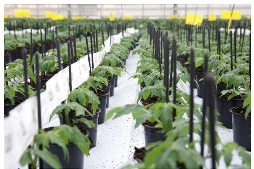
Plants should be spaced 3-4 weeks after potting

To ensure the best growth habit, plant the young plants as deeply as possible , preferably with the cotyledons right at the level of the media.