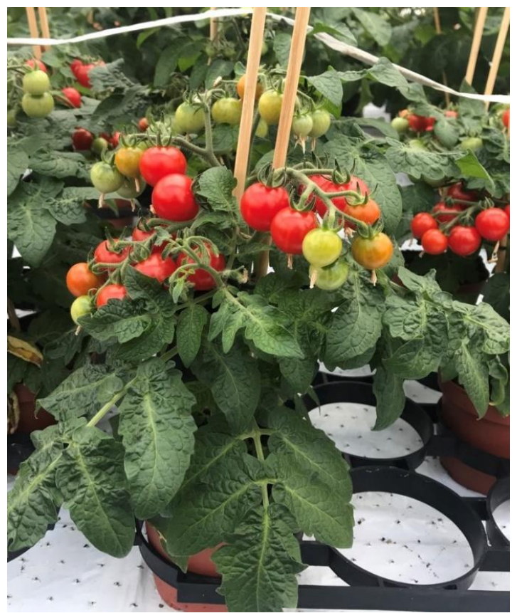
`Red Velvet' (12 weeks from sowing) ready to be shipped