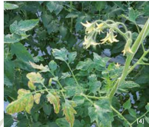
Mosaic and chlorotic leaves