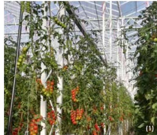
Thin and elongated heads