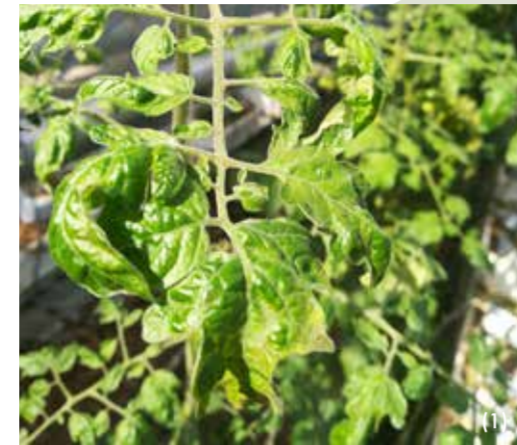
Bulging of leaves