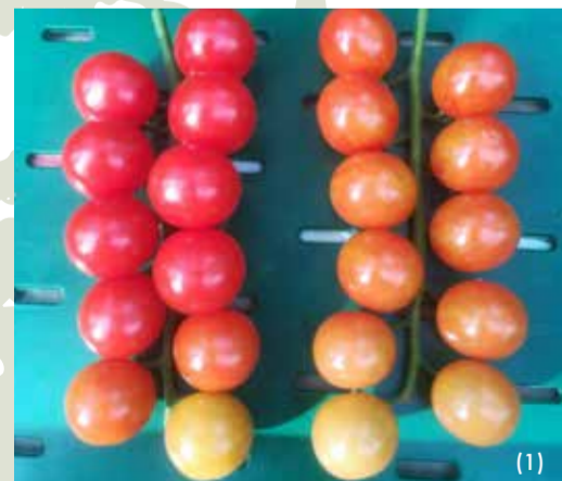
Fruits remain orange (right)