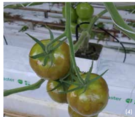
Rugose symptoms on fruits