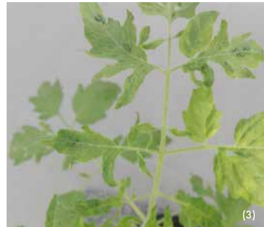
Fern shaped leaves