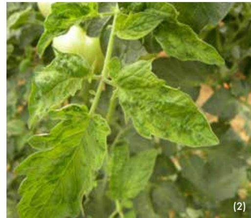
Mosaic pattern on leaves