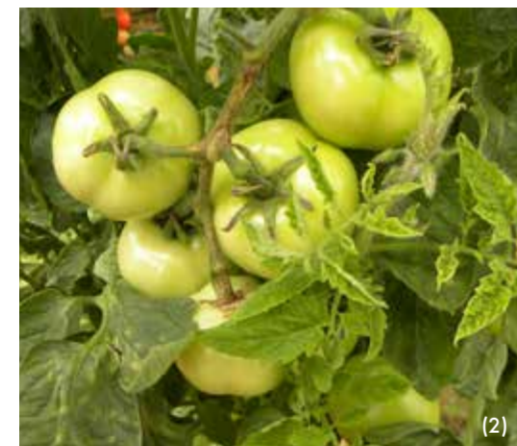
Necrotic stalk, petiole & calyx