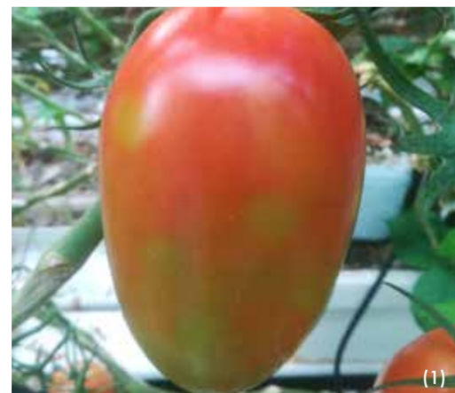
Yellowing spots on fruits