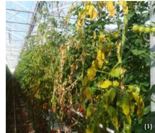
Wilting, chlorotic & dying plant