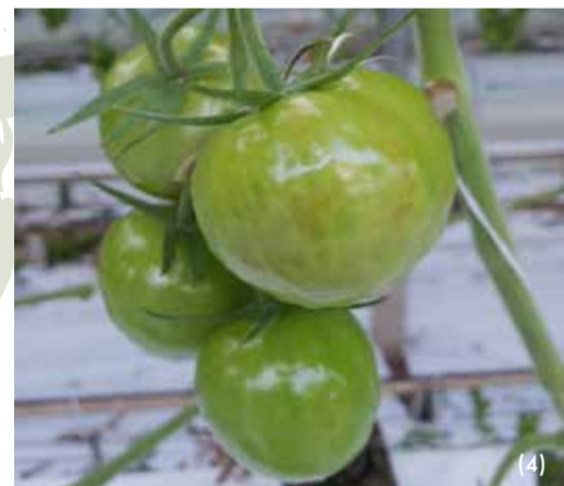
Brown patches on fruits