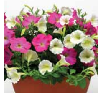
Petunia Vogue O

Height: 6 to 12 in. (15 to 30 cm) Spread: 30 to 39 in. (75 cm to 1 m) Plug crop time: 4 to 6 weeks Transplant to finish: 6 to 7 weeks Bloom time: 5 to 7 days (estimated)