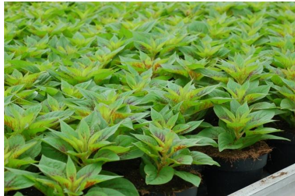
Ready to pinch – excellent take off. Note: excellent uniformity