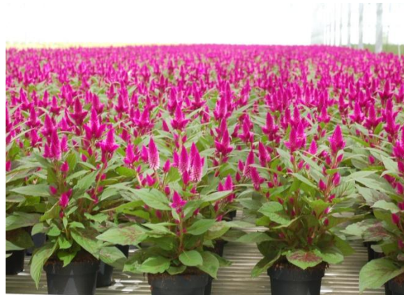
Well-branched plants, showy flowers, uniform response