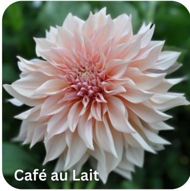
Café au Lait

Dahlia liners usually cost less and are easier to plant than tubers. Each liner will produce a full size plant, often blooming earlier than tubers planted at the same time.