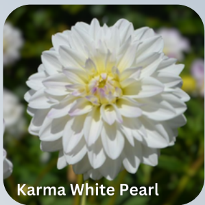
Karma White Pearl