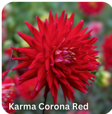
Karma Corona Red