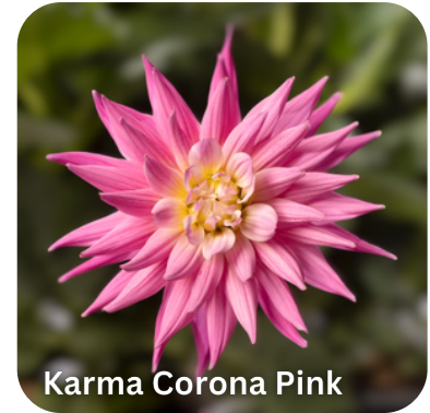
Karma Corona Pink