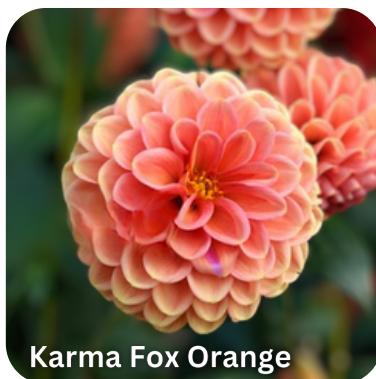
Karma Fox Orange