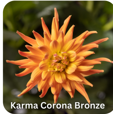
Karma Corona Bronze