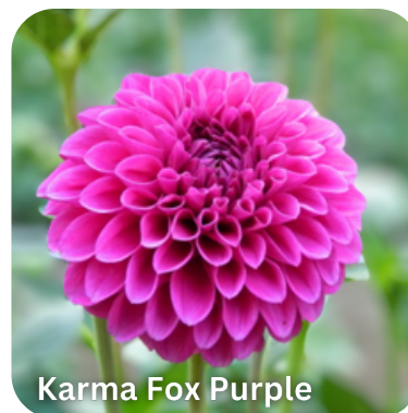
Karma Fox Purple