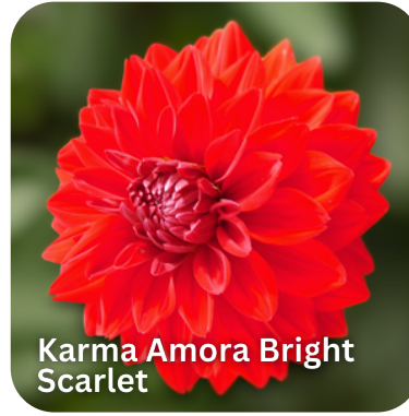
Karma Amora Bright Scarlet