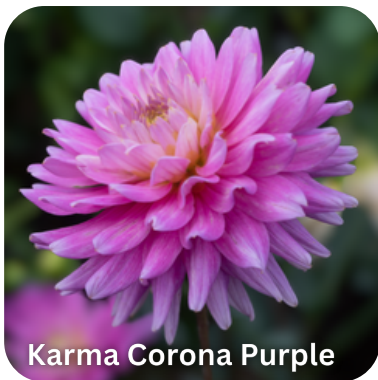
Karma Corona Purple