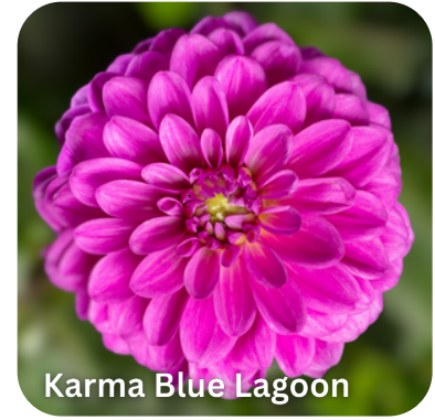
Karma Blue Lagoon