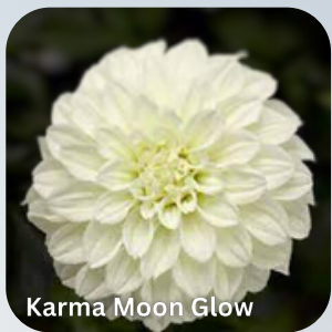
Karma Moon Glow