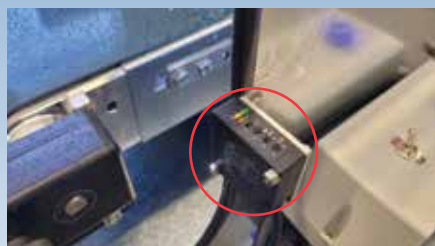
Photoelectric sensor registers if conveyor is empty or full