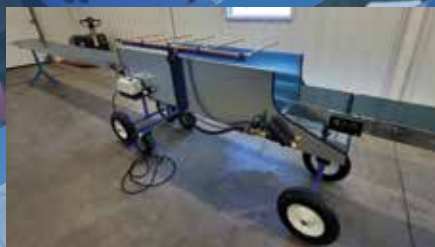
SB04 easily connects to SB10 conveyors