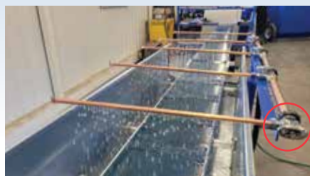
Independent valve for each water bar offers consistent watering