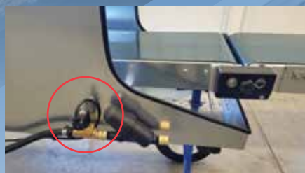
Features an electric valve to control watering starts and stops