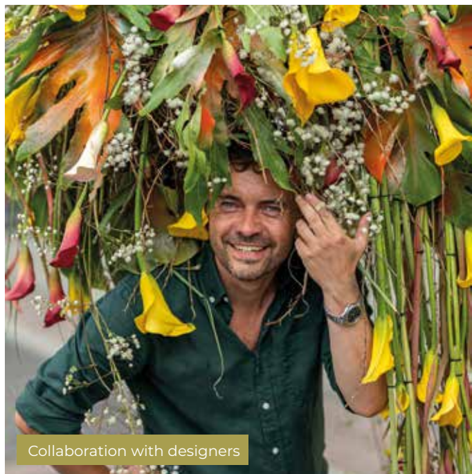
Collaboration with designers