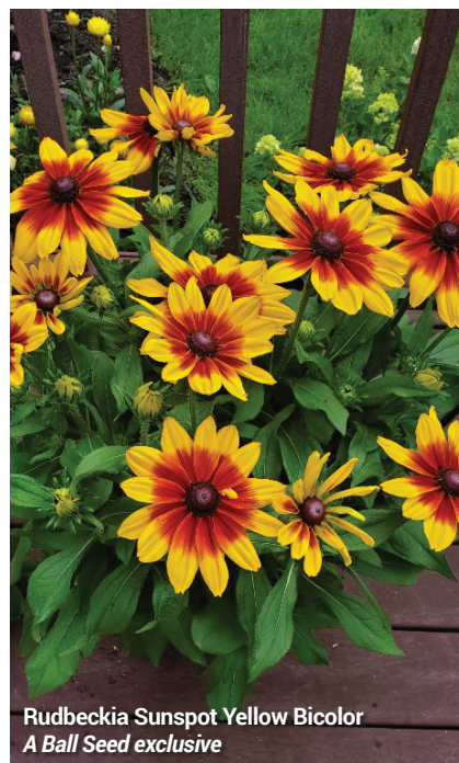
Rudbeckia Sunspot Yellow Bicolor A Ball Seed exclusive