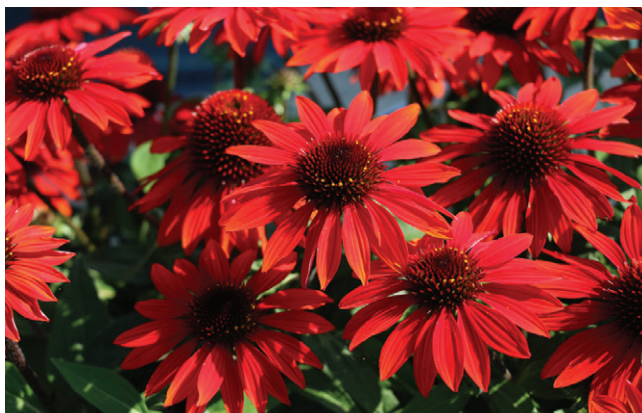
Echinacea Sombbrero® Sangrita 🟡

Height: 12 to 14 in. (30 to 36 cm) Spread: 12 to 14 in. (30 to 36 cm) USDA Hardiness Zones: 5a to 9b