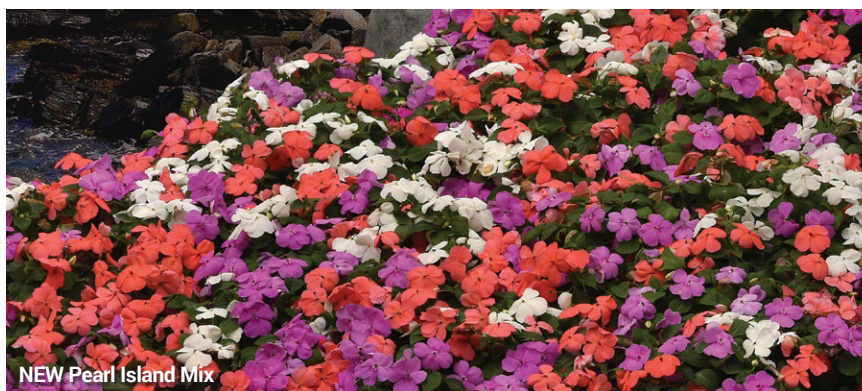
NEW Pearl Island Mix