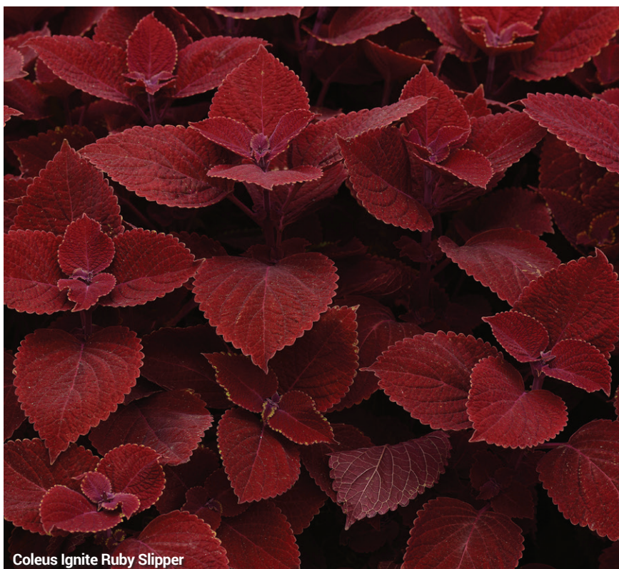
Coleus Ignite Ruby Slipper

Angelonia Archangel™ Ruby Sangria ● drought tolerant