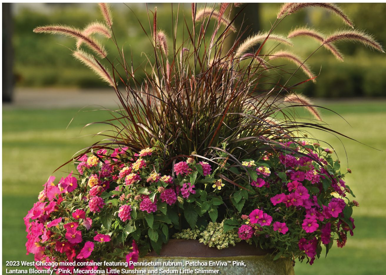
2023 West Chicago mixed container featuring Pennisetum rubrum, Petchoa EnViva™ Pink, Lantana Bloomify™ Pink, Mecardonia Little Sunshine and Sedum Little Shimmer