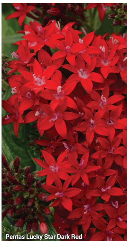
Pentas Lucky Star Dark Red