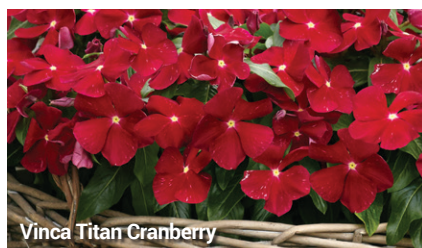
Vinca Titan Cranberry