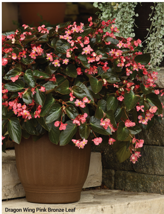
Dragon Wing Pink Bronze Leaf