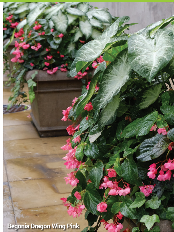
Begonia Dragon Wing Pink