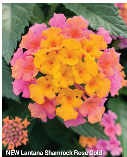
NEW Lantana Shamrock Rose Gold