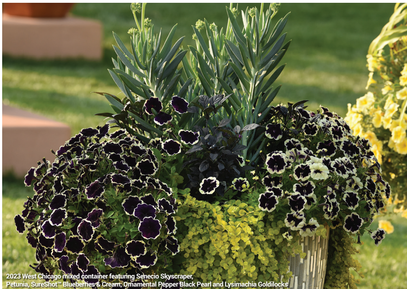
2023 West Chicago mixed container featuring Senecio Skyscraper, Petunia, SureShot™ Blueberries & Cream, Ornamental Pepper Black Pearl and Lysimachia Goldilocks