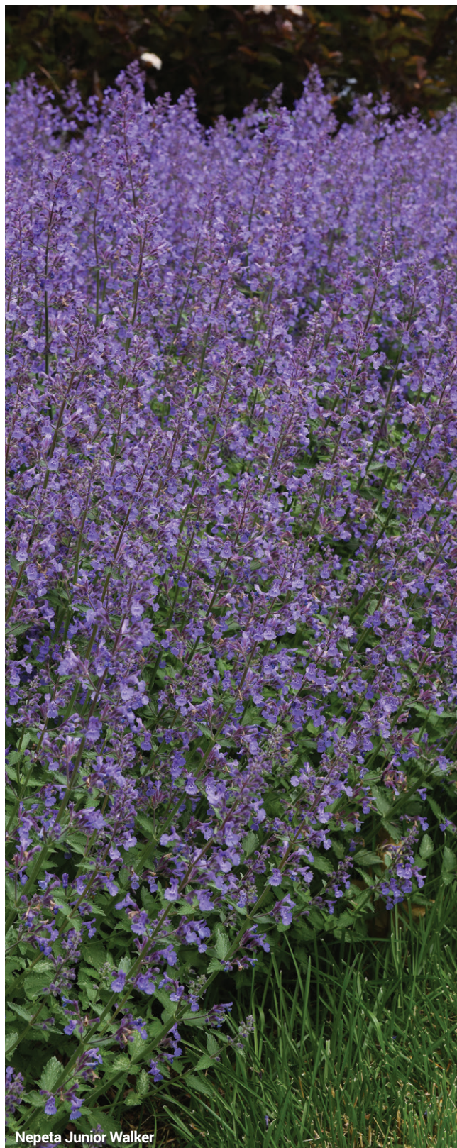
Nepeta Junior Walker

Better than Lavender Hidcote due to its bigger blooms and better habit in the landscape.