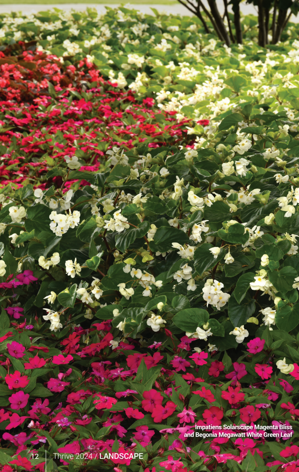
Impatiens Solarscape Magenta Bliss and Begonia Megawatt White Green Leaf

This selection of extra-large format plants can fill bigger spaces with masses of color.