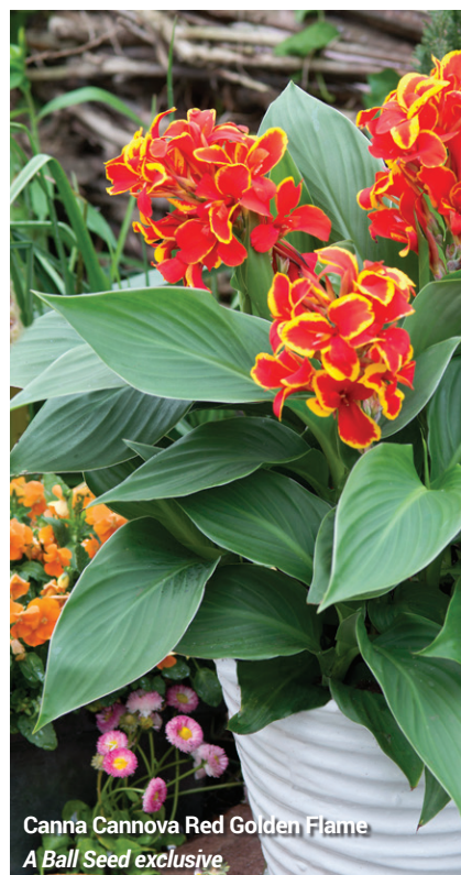
Canna Cannova Red Golden Flame A Ball Seed exclusive