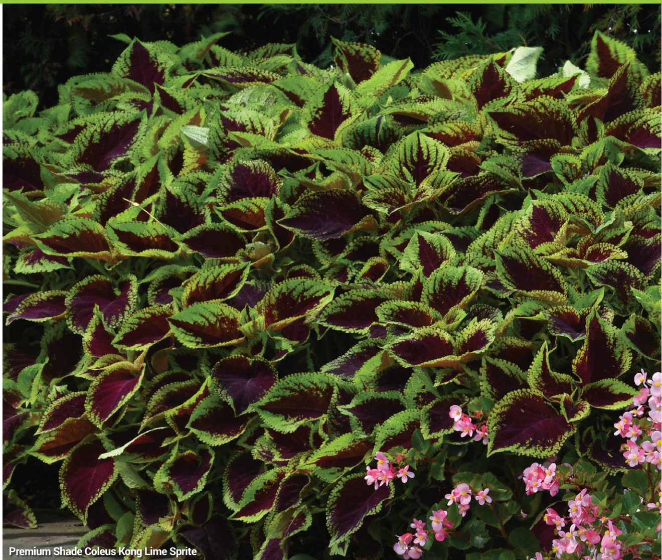
Premium Shade Coleus Kong Lime Sprite