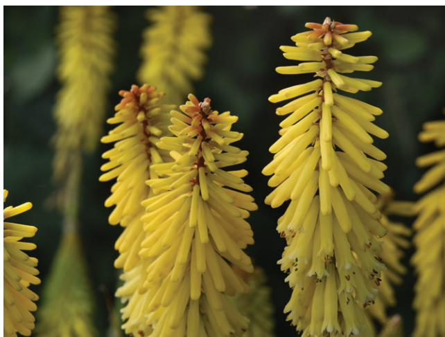
Kniphofia Glowstick 🟡 drought tolerant

Height: 26 to 29 in. (66 to 74 cm) Spread: 19 to 22 in. (48 to 56 cm) USDA Hardiness Zones: 6b to 9b