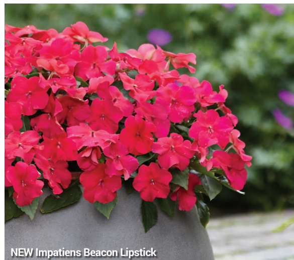
NEW Impatiens Beacon Lipstick