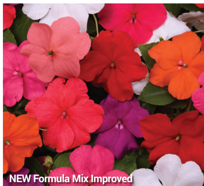
NEW Formula Mix Improved