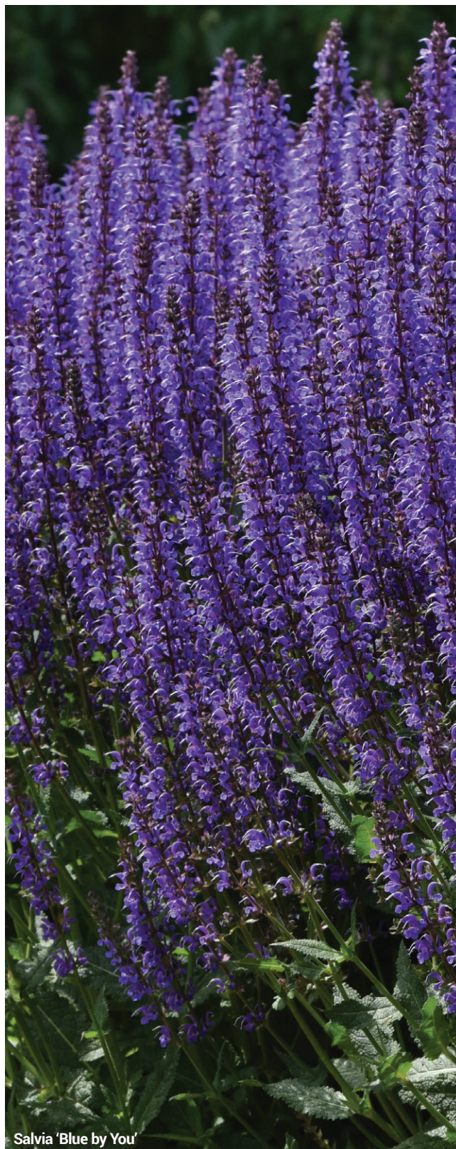
Salvia 'Blue by You'

Better than Nepeta Walker's Low for earlier blooming in the landscape and a better habit that won't lodge open.