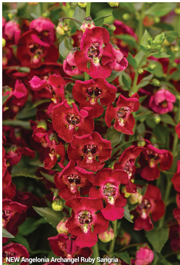
NEW Angelonia Archangel Ruby Sangria