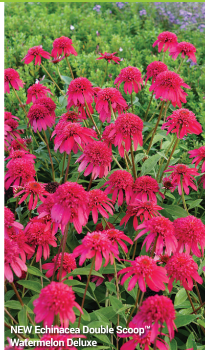
NEW Echinacea Double Scoop™ Watermelon Deluxe

Fall mixed container featuring Jade Princess Millet, Chilly Chili Ornamental Pepper, Creeping Jenny, Red Ryder Garden Mum, Carnival Black Olive Heuchera, Katelli Bronze Garden Mum