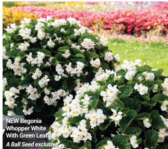
NEW Begonia Whopper White With Green Leaf A Ball Seed exclusive

The top varieties that perform year after year in the landscape.