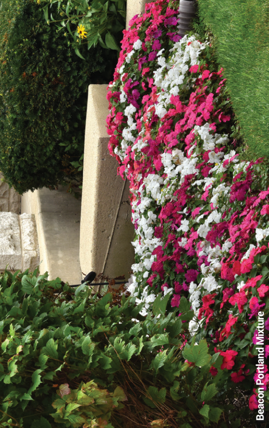
Beacon Portland Mixture

"If you fail to plan, you're planning to fail!" ... Ben Franklin's wise words still ring true today. What's YOUR plan for success? We've lined up your seasonal tasks with what your growers need to do to get YOU the goods. Tip: Plan 6 months ahead for best availability! We suggest you use this handy feature as a guideline — add your notes and tweak it to make your own Planner for Success.