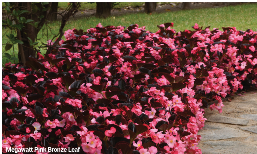
Megawatt Pink Bronze Leaf