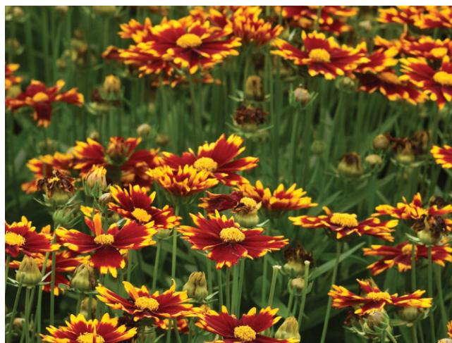
Coreopsis UpTick™ Gold & Bronze 🟡

Height: 26 to 29 in. (66 to 74 cm) Spread: 19 to 22 in. (48 to 56 cm) USDA Hardiness Zones: 6b to 9b