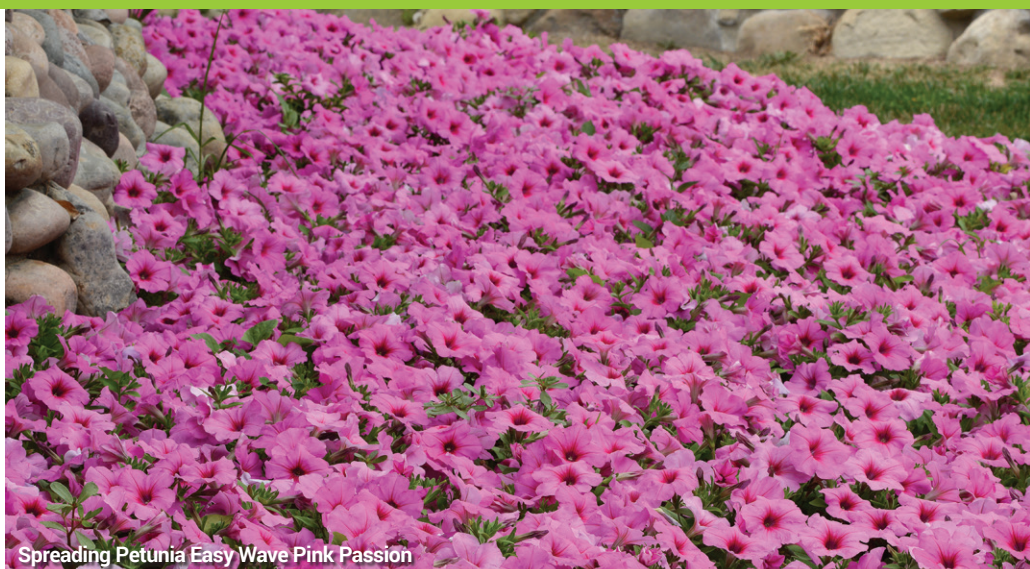
Spreading Petunia Easy Wave Pink Passion