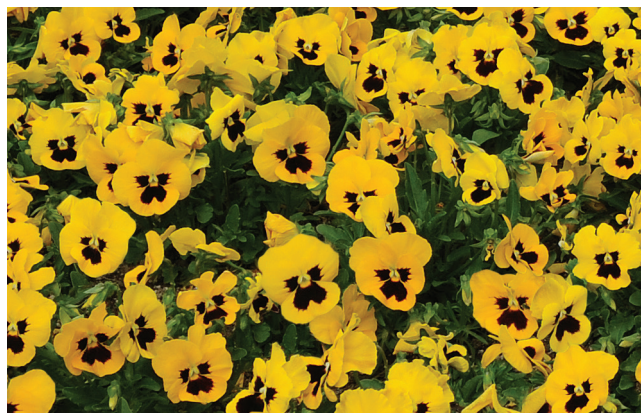
Pansy Panola® XP Yellow Blotch 🟡

Height: 18 to 20 in. (46 to 51 cm) Spread: 22 to 24 in. (56 to 61 cm) USDA Hardiness Zones: 4b to 9b