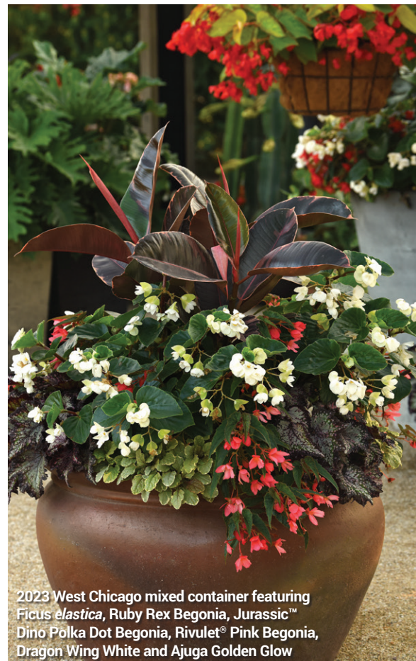
2023 West Chicago mixed container featuring Ficus elastica , Ruby Rex Begonia, Jurassic™ Dino Polka Dot Begonia, Rivulet® Pink Begonia, Dragon Wing White and Ajuga Golden Glow