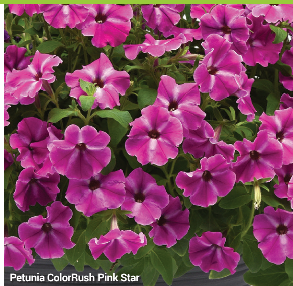
Petunia ColorRush Pink Star