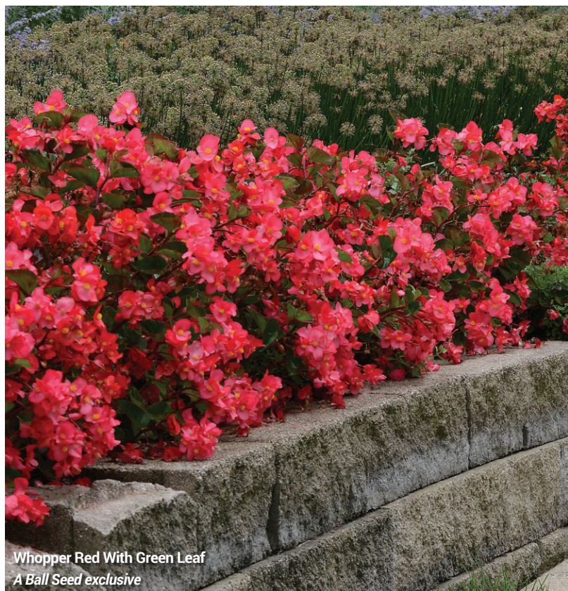
Whopper Red With Green Leaf A Ball Seed exclusive