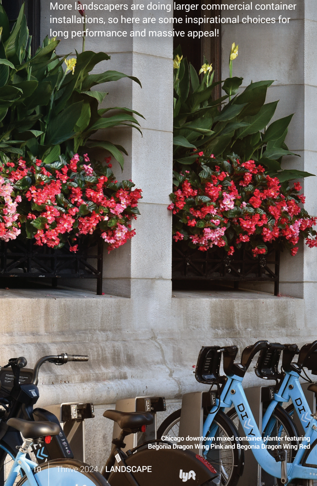
Chicago downtown mixed container planter featuring Begonia Dragon Wing Pink and Begonia Dragon Wing Red

More landscapers are doing larger commercial container installations, so here are some inspirational choices for long performance and massive appeal!