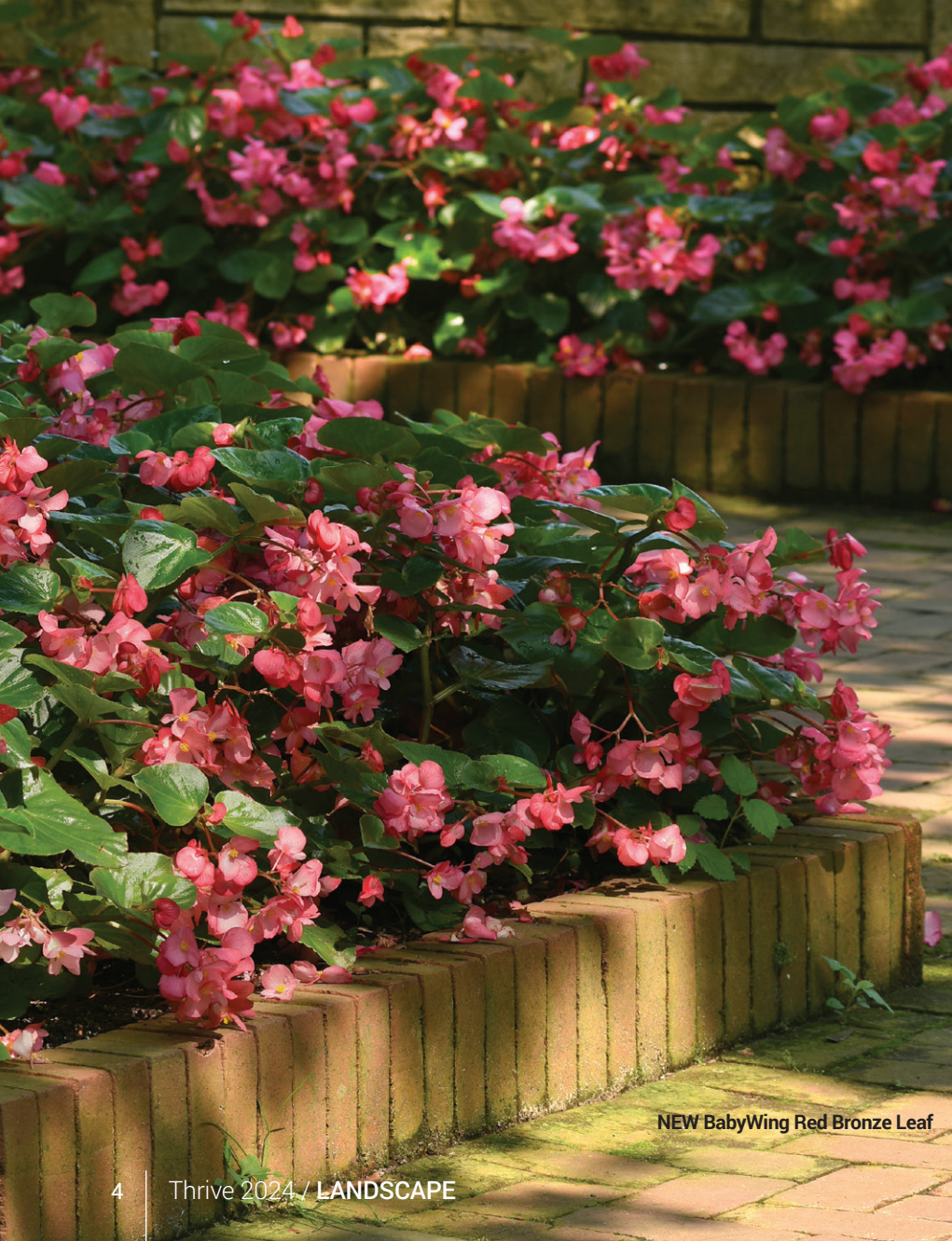
NEW BabyWing Red Bronze Leaf

There are several varieties of interspecific begonias today that can be easily used in the landscape. They offer hardier plants, more flowers, better branching and habits that thrive from the landscape to hanging baskets.