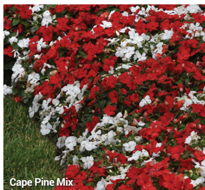
Cape Pine Mix