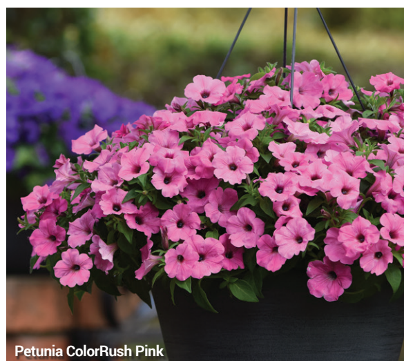
Petunia ColorRush Pink

Height: 10 to 12 in. (25 to 30 cm) Spread: 24 to 36 in. (61 to 91 cm)