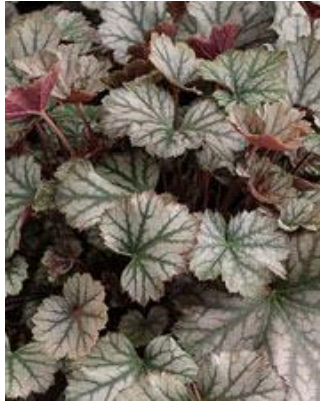
Ajuga tenorii Chocolate Chip