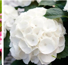
Kanmara ® White