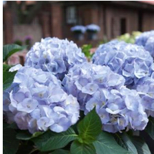
New Kanmara ® Blue