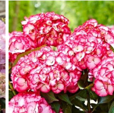
Kanmara® Strong Pink