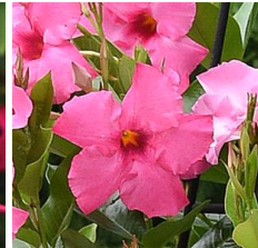
New Tourmaline Deep Rose