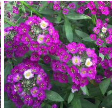
Passionaria™ Dark Purple